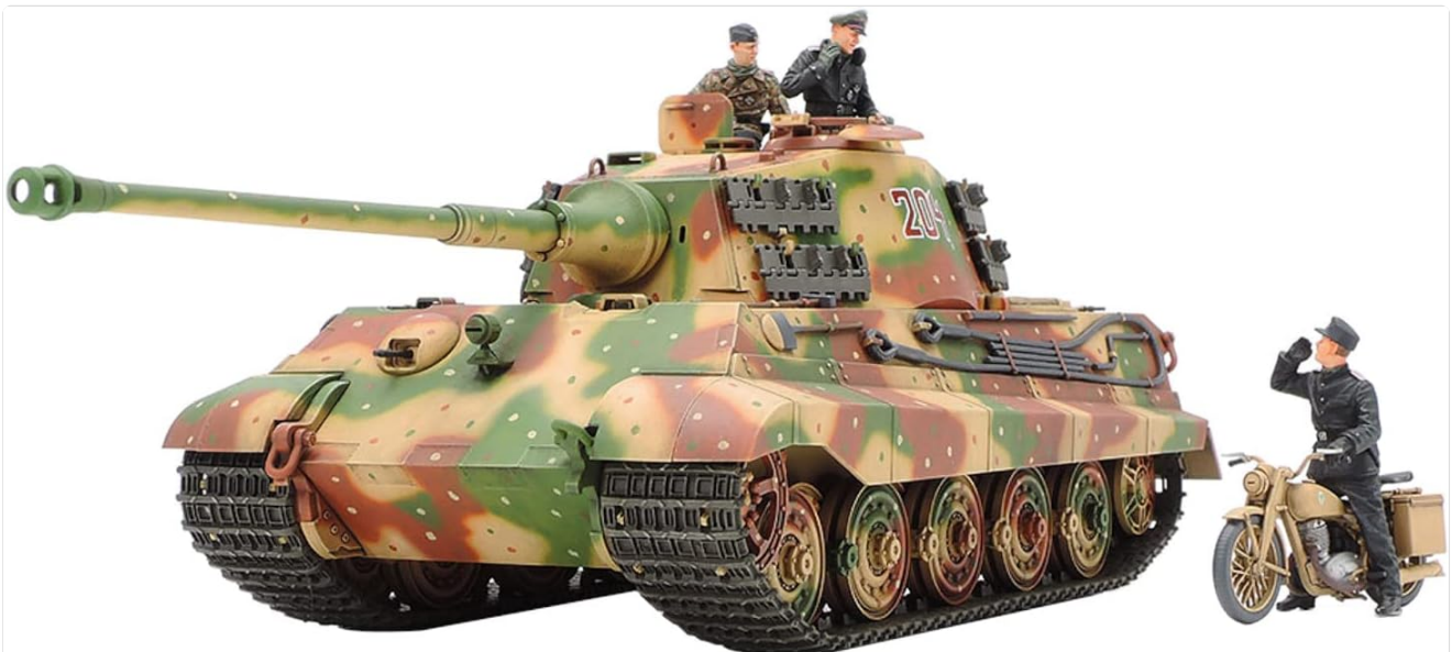
Figure 1.1: Fully assembled Tamiya 1/35 German King Tiger model, showcasing its detailed camouflage, crew figures, and accompanying motorcycle.

This manual provides comprehensive instructions for the assembly of the Tamiya 1/35 German King Tiger model kit. This highly detailed kit allows enthusiasts to recreate the iconic World War II armored vehicle, complete with intricate features and accompanying figures. Please read all instructions carefully before beginning assembly.