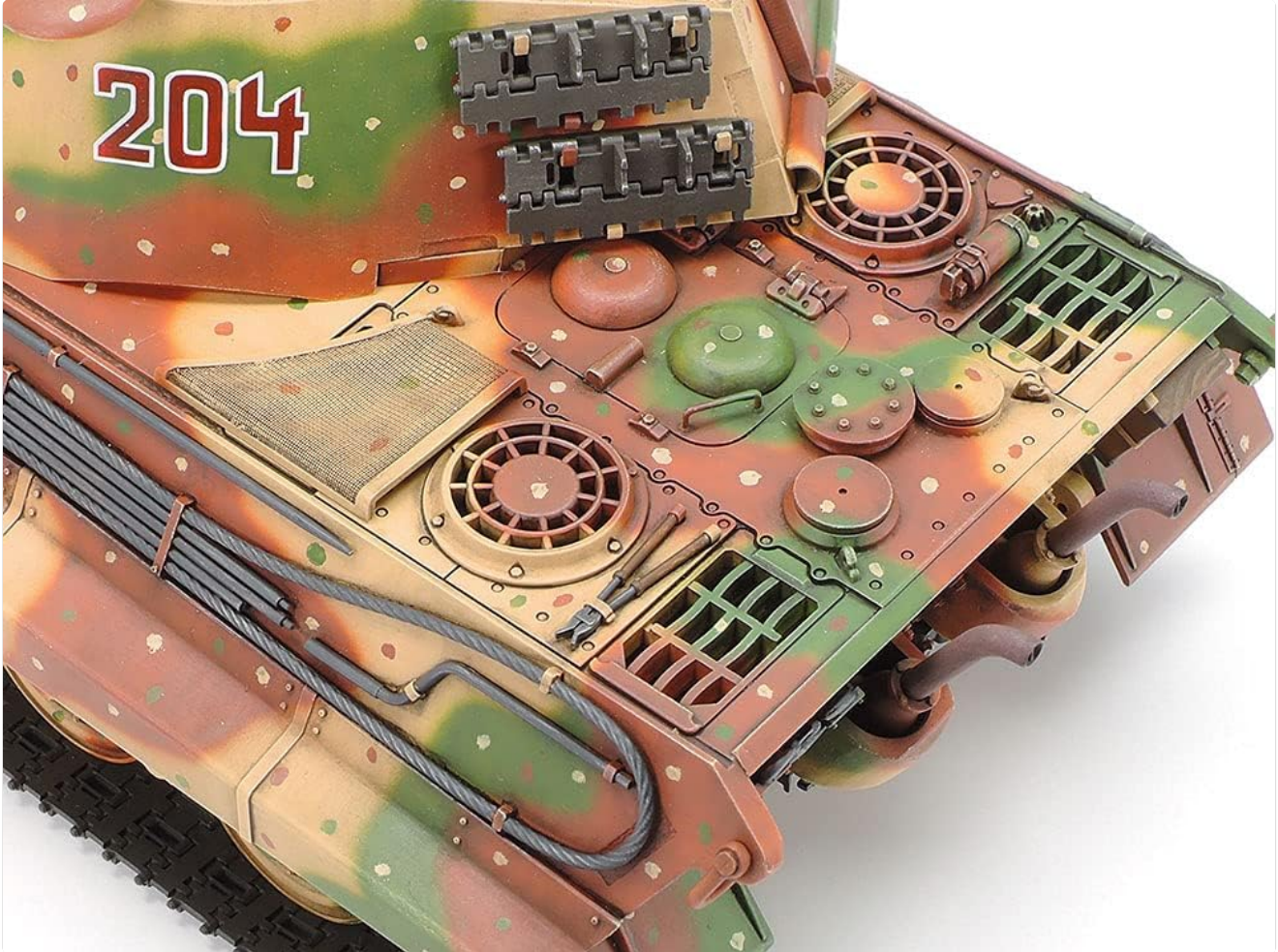
Figure 4.2: Detailed top view of the King Tiger model, highlighting the engine deck grilles and various hatches.

Begin by assembling the main hull sections. Pay close attention to the alignment of the side and bottom plates to ensure a sturdy base for the model.