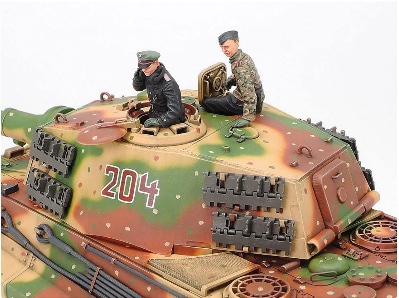
Figure 4.3: A close-up view of the King Tiger's turret, showing the detailed gun mantles and the placement of the tank crew figures.