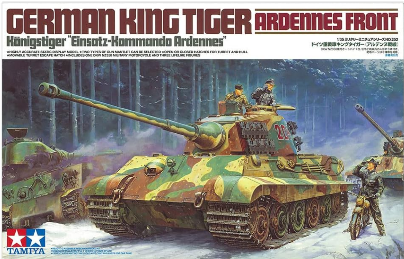
Figure 3.1: The kit box art for the Tamiya 1/35 German King Tiger, showing the tank in an Ardennes Front setting.