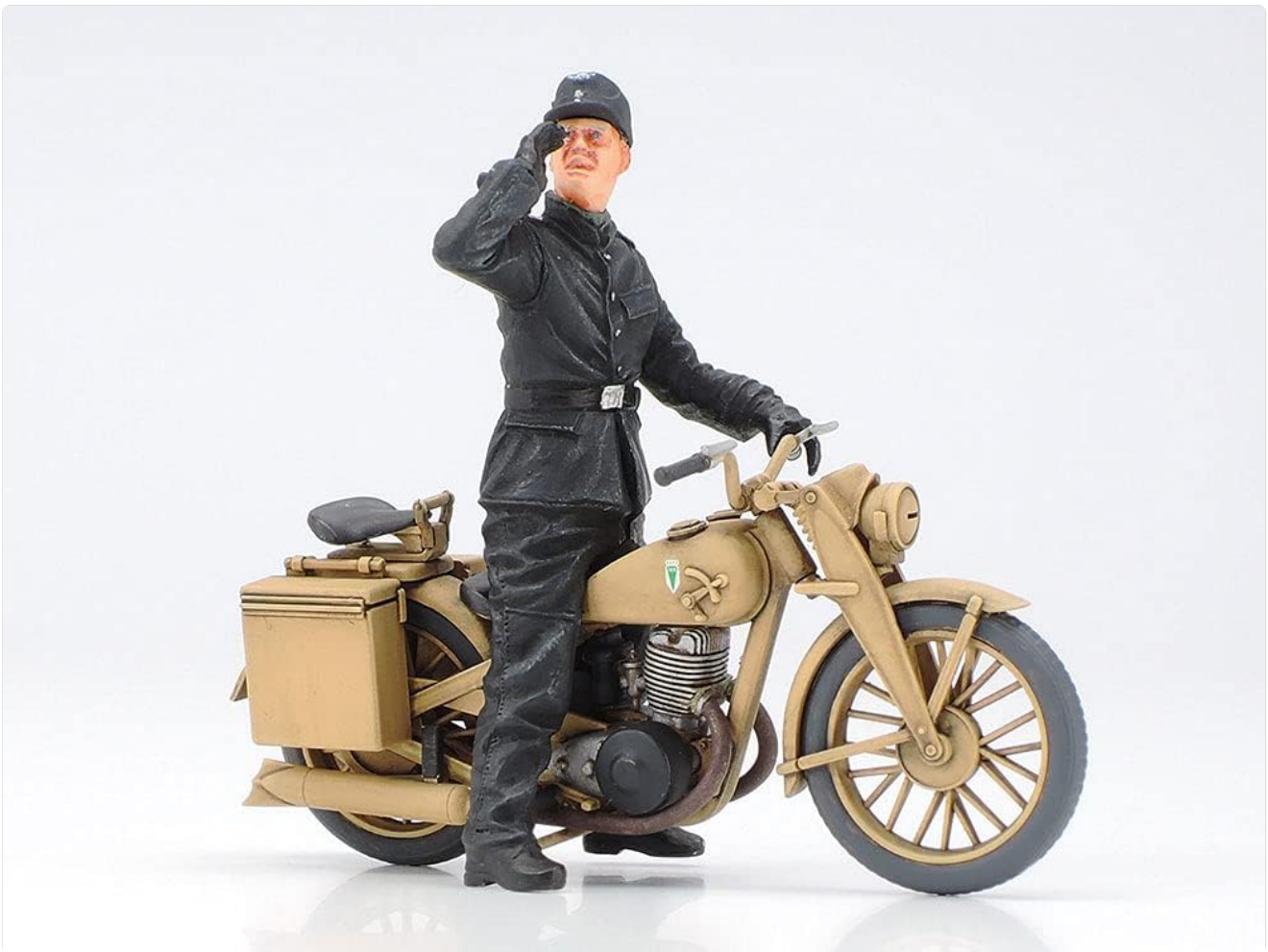
Figure 4.5: The assembled motorcycle and rider figure, featuring accurate engine replication and additional small details.