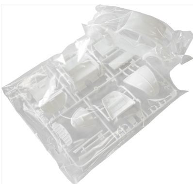
A sprue of white plastic parts, including the main body shell and interior components.