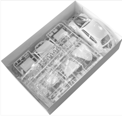
An open kit box revealing the various plastic sprues and components inside.