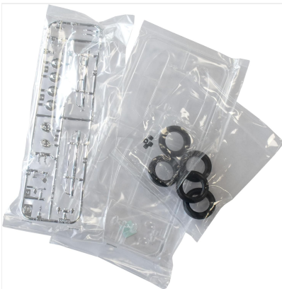
A bag containing clear plastic parts for windows and lights, along with rubber tires.