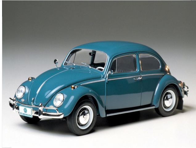
An example of a finished Tamiya Volkswagen Beetle model, showcasing the potential for detailed painting and assembly.