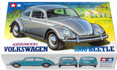
The kit box, displaying the Tamiya 1/24 Volkswagen 1300 Beetle 1966 model art.