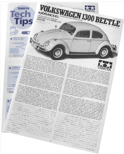
The detailed instruction manual sheet, providing step-by-step assembly guidance.