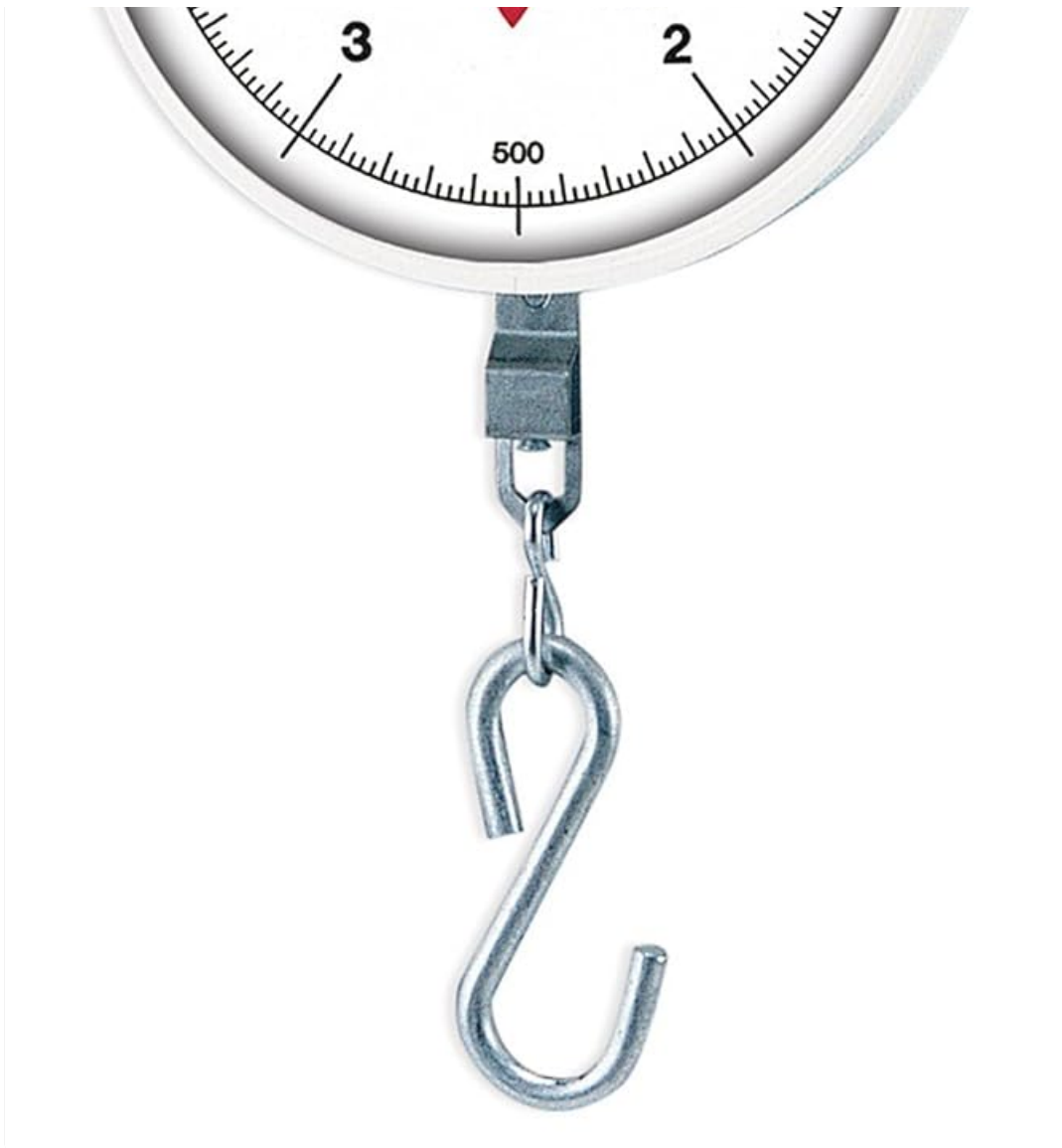
Figure 1: Detecto MCS-60H Hanging Dial Scale. This image shows the full view of the scale, highlighting its circular dial with numerical markings, the red pointer, and the S-hook attachment at the bottom for weighing items.