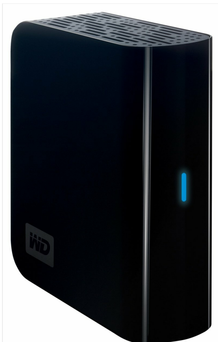
Front view of the Western Digital My Book Essential 1TB External Hard Drive, showcasing its sleek black design.