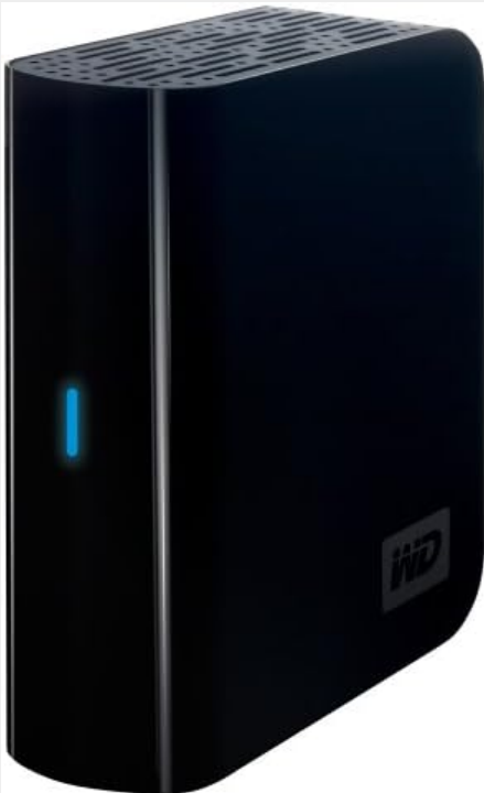
Front view of the hard drive with its blue activity indicator light illuminated, signifying operation.