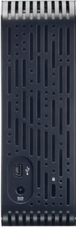
Rear view of the hard drive, displaying the power input and USB 2.0 port for connectivity.