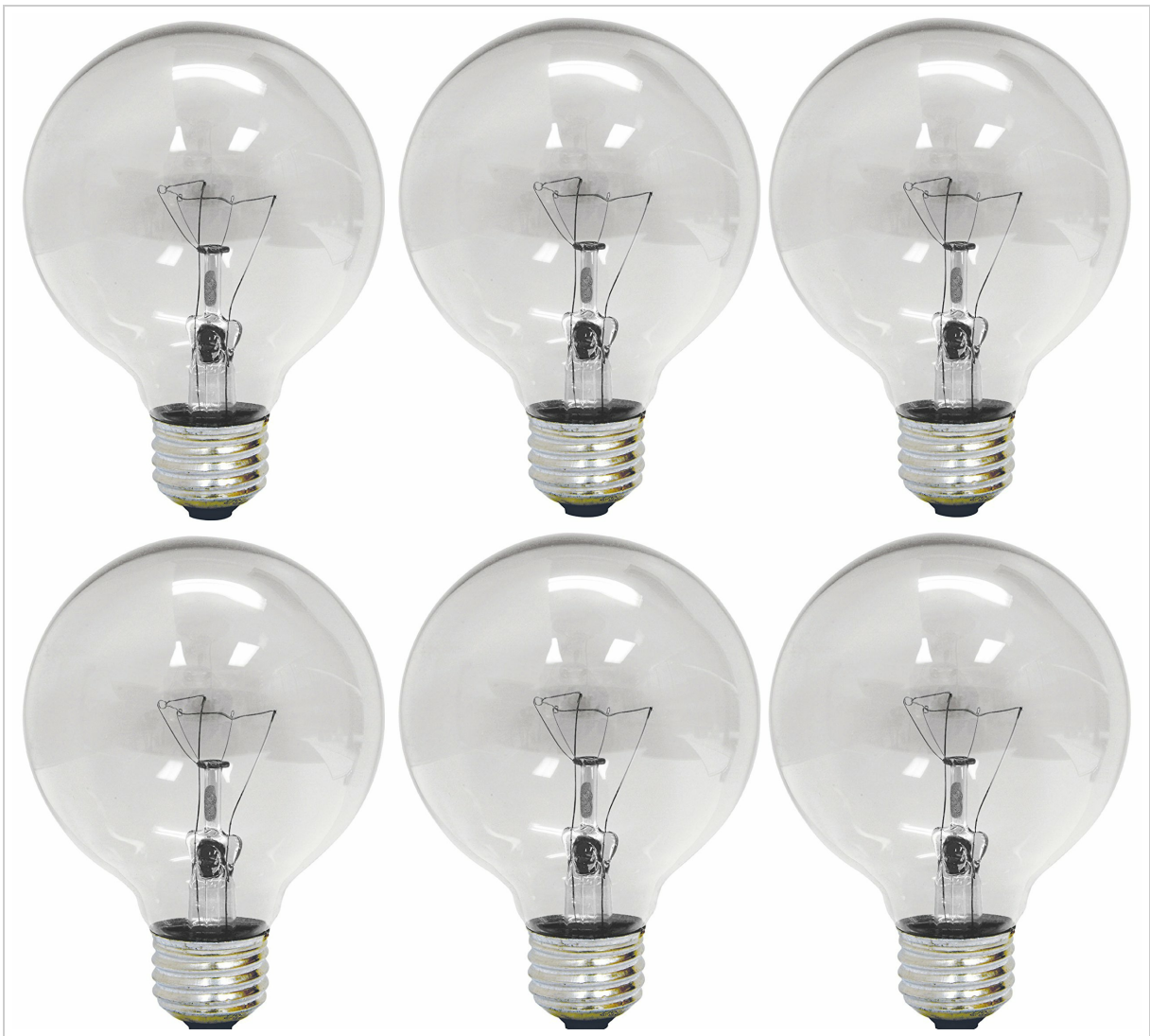
Image 1.1: GE G25 Crystal Clear Incandescent Globe Light Bulb. This image shows the clear glass globe shape and the internal filament structure of the bulb.