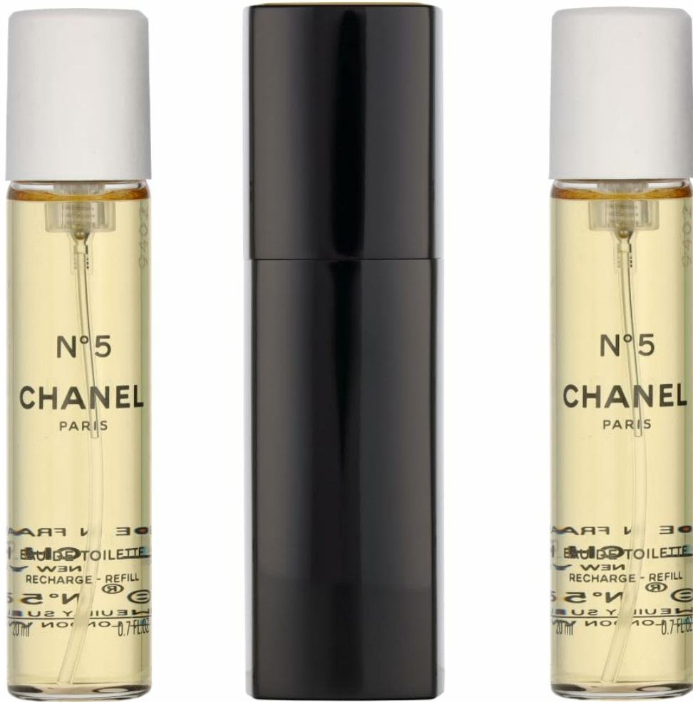
Image: Close-up view of the CHANEL N°5 Eau De Toilette Purse Spray (black casing) alongside its two clear glass refill vials, highlighting the portable design.