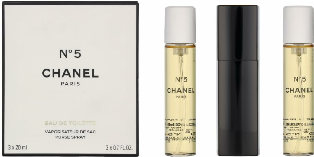
Image: The complete CHANEL N°5 Eau De Toilette Purse Spray Set, showing the elegant packaging box and the individual components: the purse spray and two refill vials.