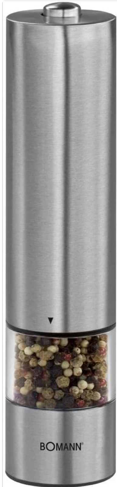
Image 1: Front view of the Bomann PSM 437 N CB Electric Pepper and Salt Mill, showcasing its stainless steel body and transparent spice chamber filled with mixed peppercorns.