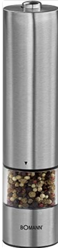
Image 2: A view of the top section of the mill, indicating where batteries are inserted. This image helps visualize the battery compartment access.