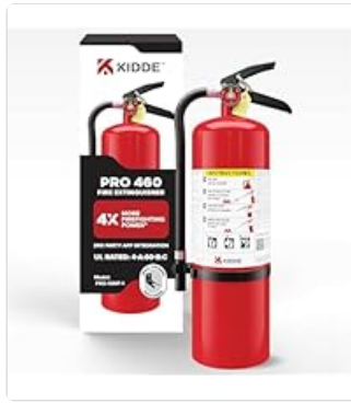
Visual guide to the P.A.S.S. method for fire extinguisher operation.