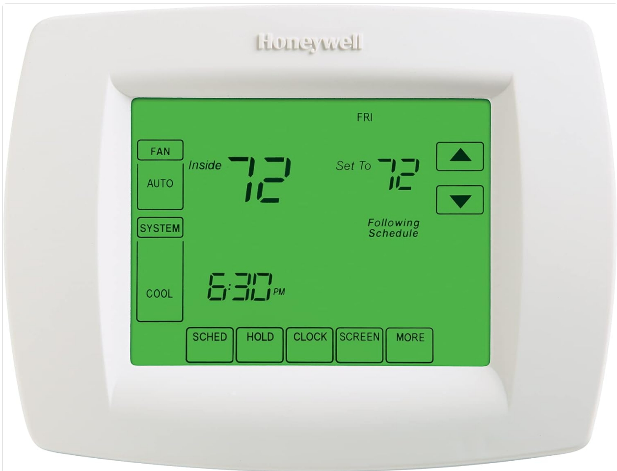
Image 1.1: Front view of the Honeywell Vision Pro 8000 Thermostat, showing the digital display in Cool mode with an indoor temperature of 72 degrees Fahrenheit.