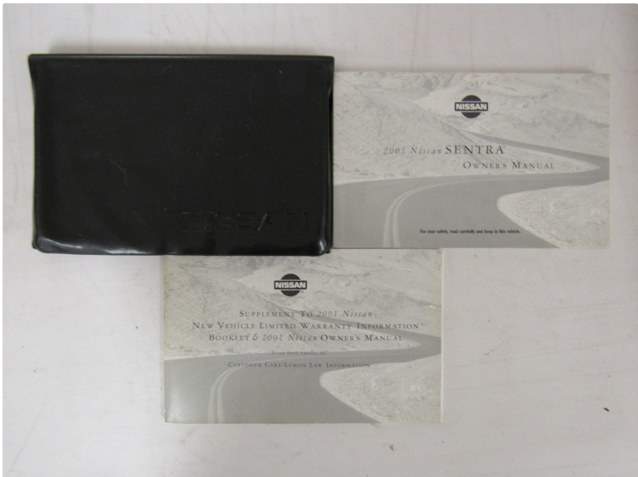
Image: The black protective pouch for the Nissan Owner's Manual, featuring the embossed 'NISSAN' logo.