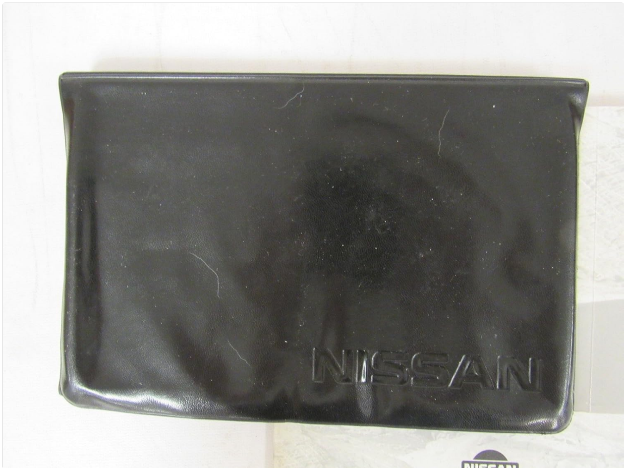
Image: The cover of a 2001 Nissan Sentra Owner's Manual, illustrating the typical design and branding found in these documents.