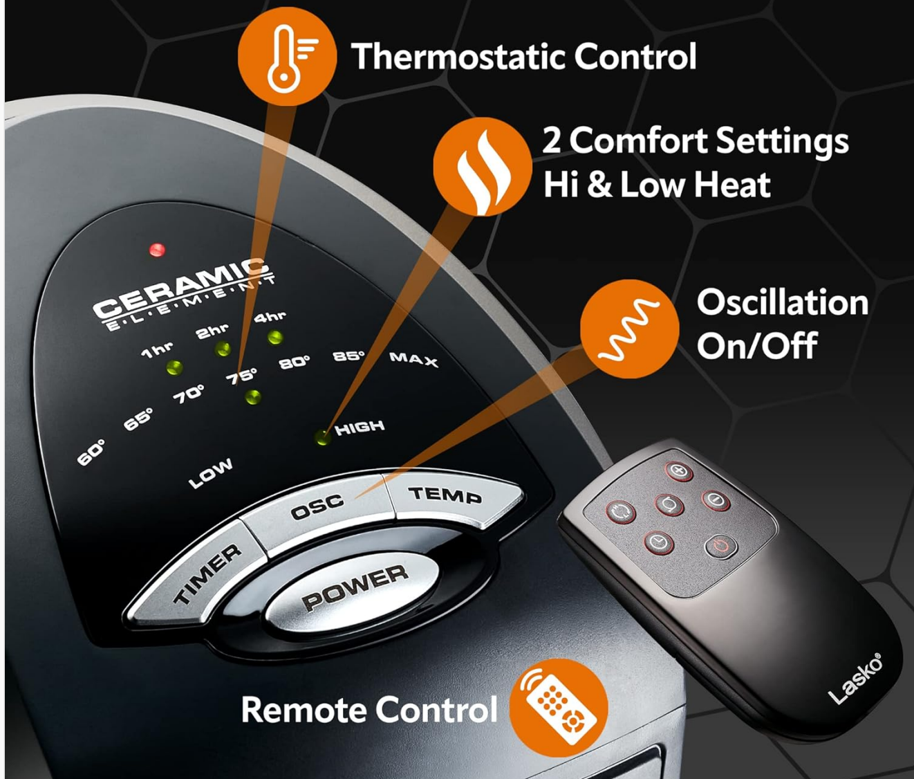
Figure 5.1: Key Features of the Control Panel.