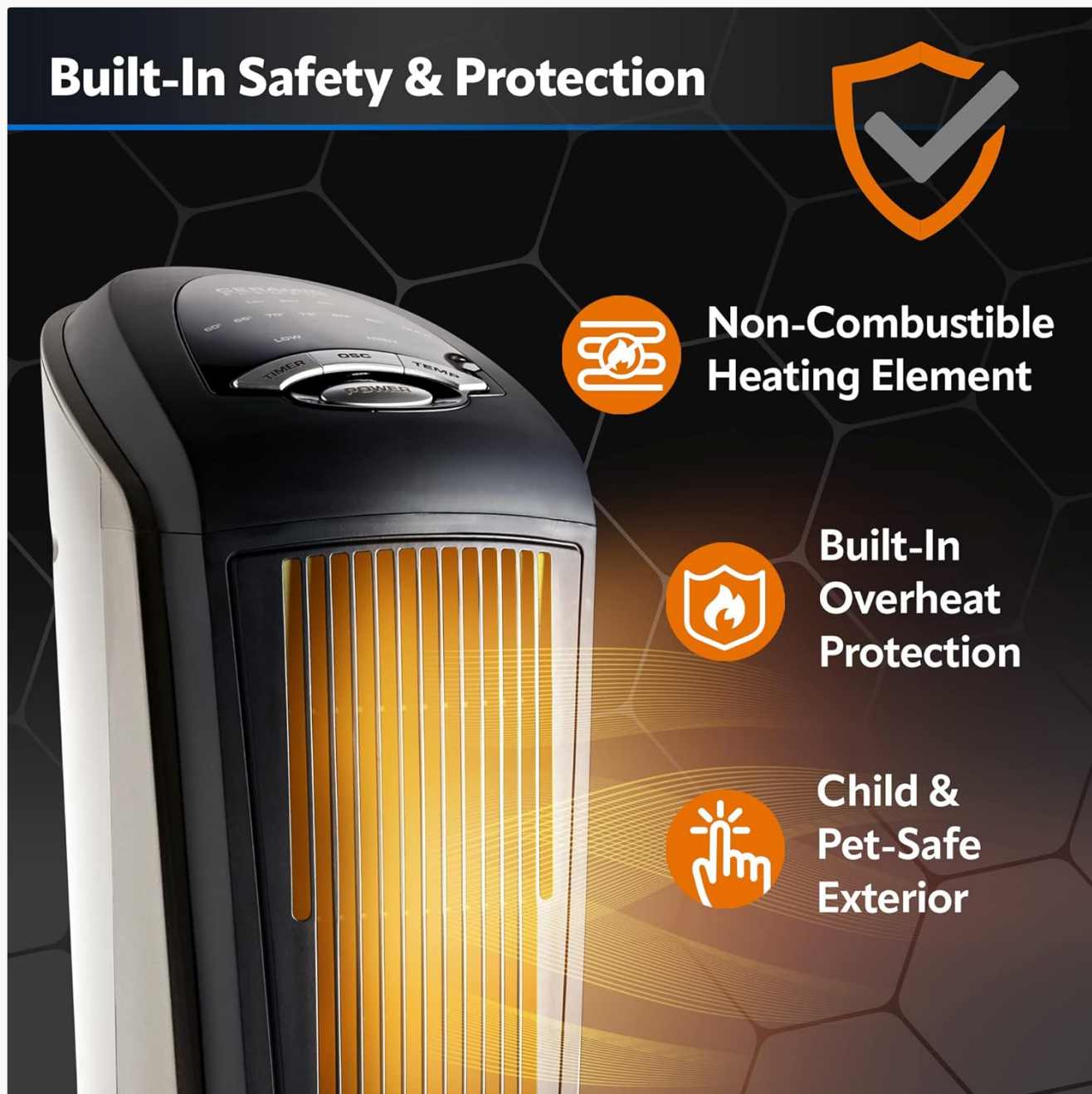
Figure 2.1: Built-in Safety & Protection features of the Lasko Ceramic Tower Heater.

product or available on the manufacturer's website.