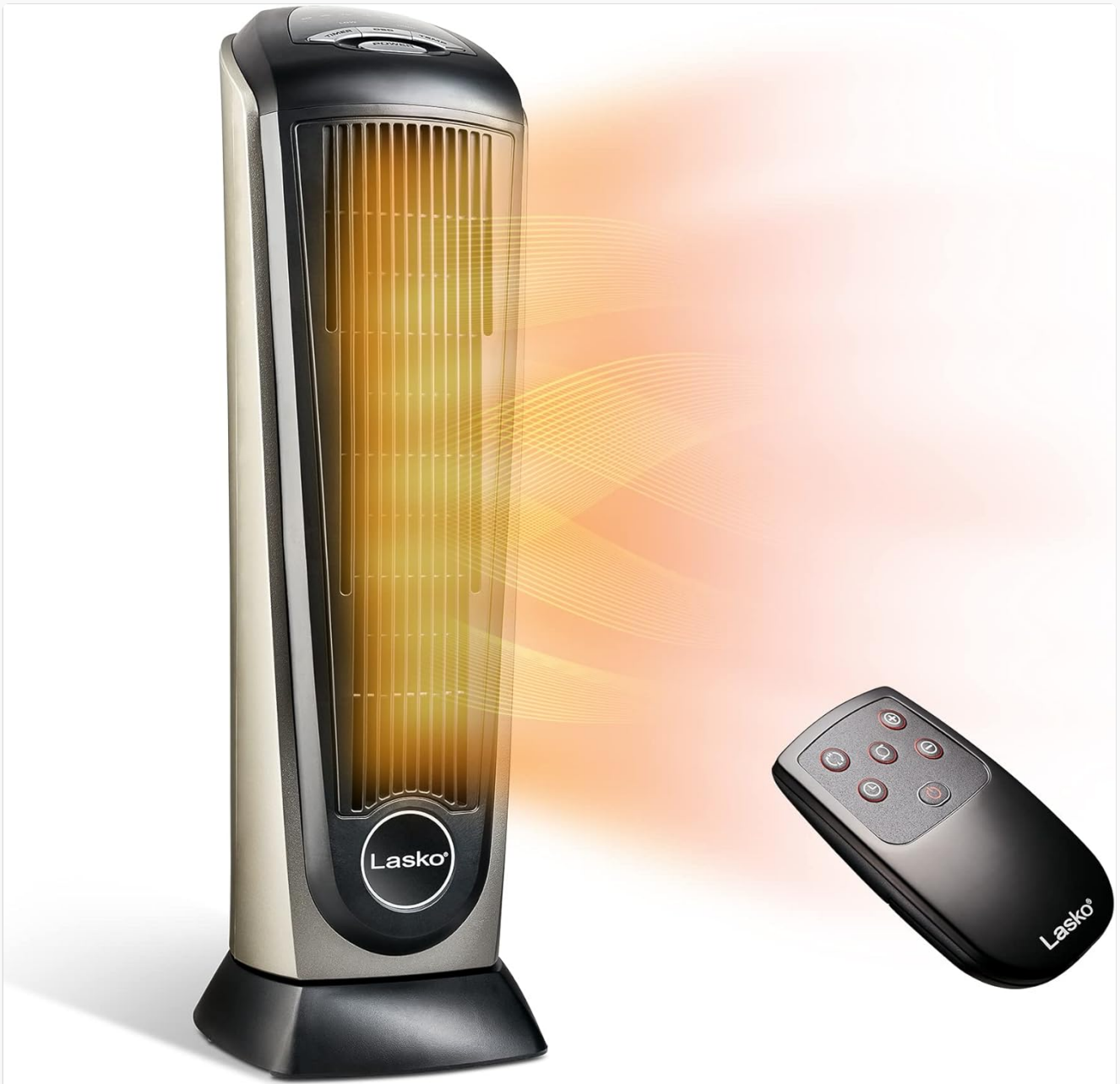
Figure 4.1: Lasko Ceramic Tower Space Heater ready for use.