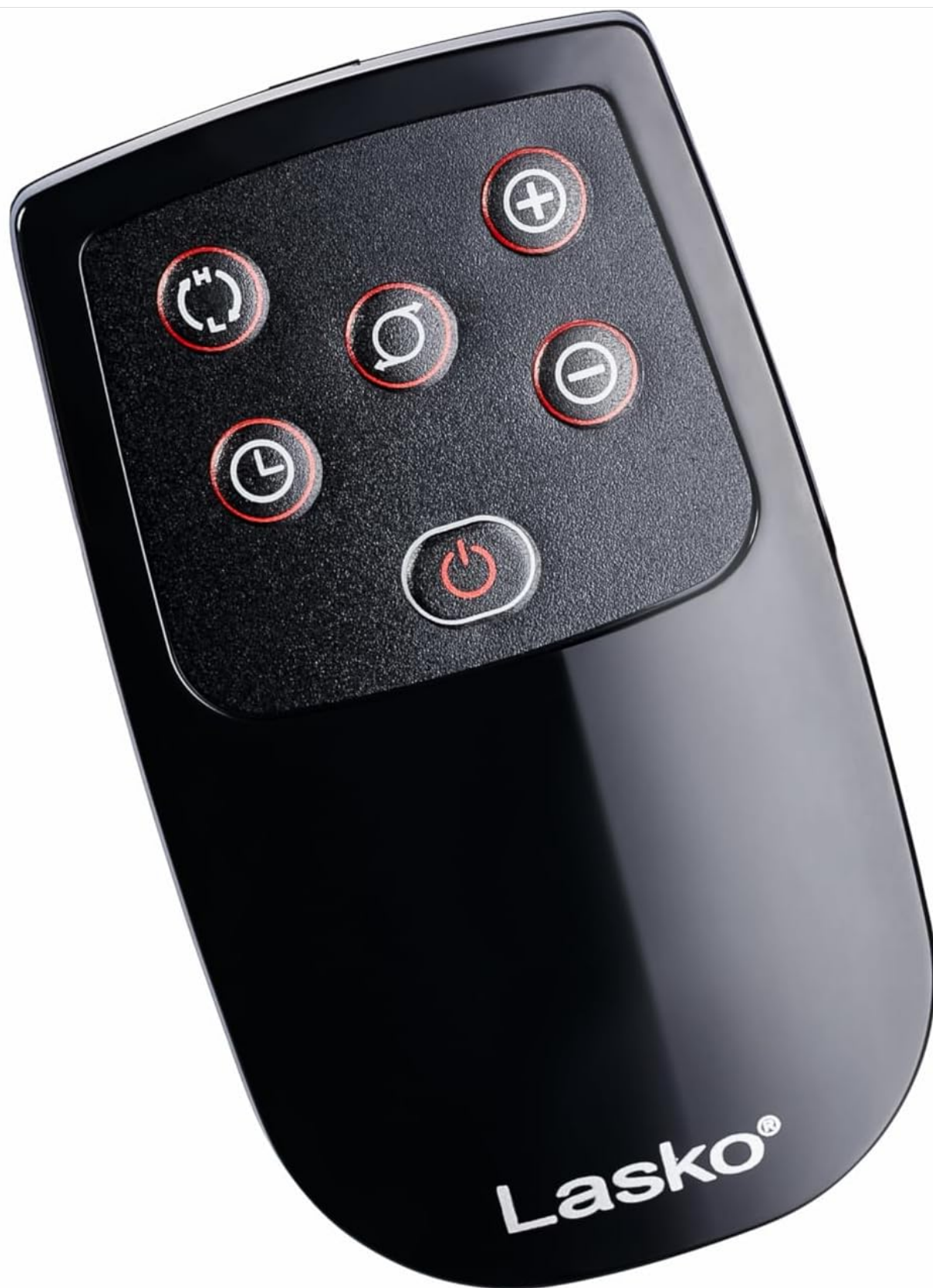
Figure 5.2: Multi-Function Remote Control.