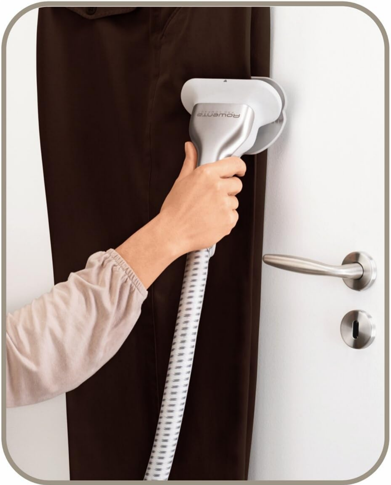
Image: A user demonstrating steaming brown pants hung on a door using the steamer.