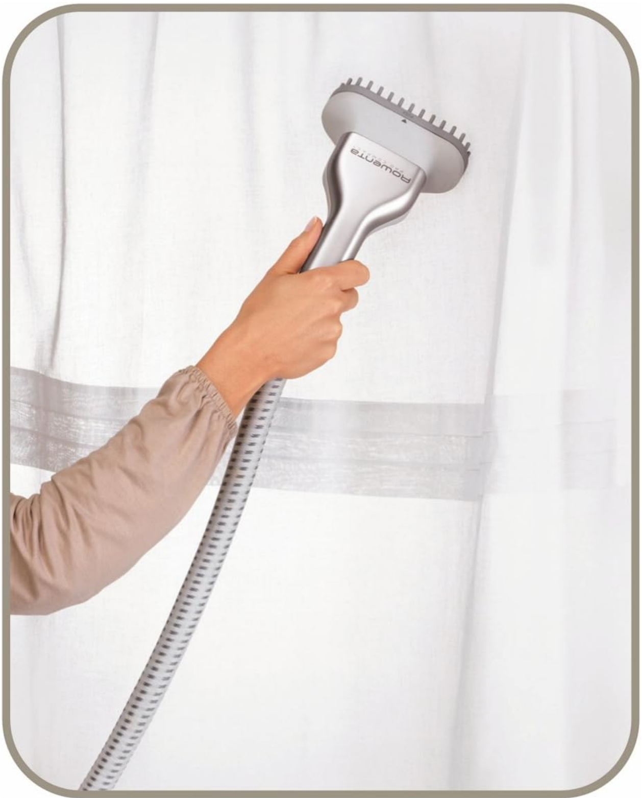
Image: A user demonstrating steaming white curtains using the steamer.