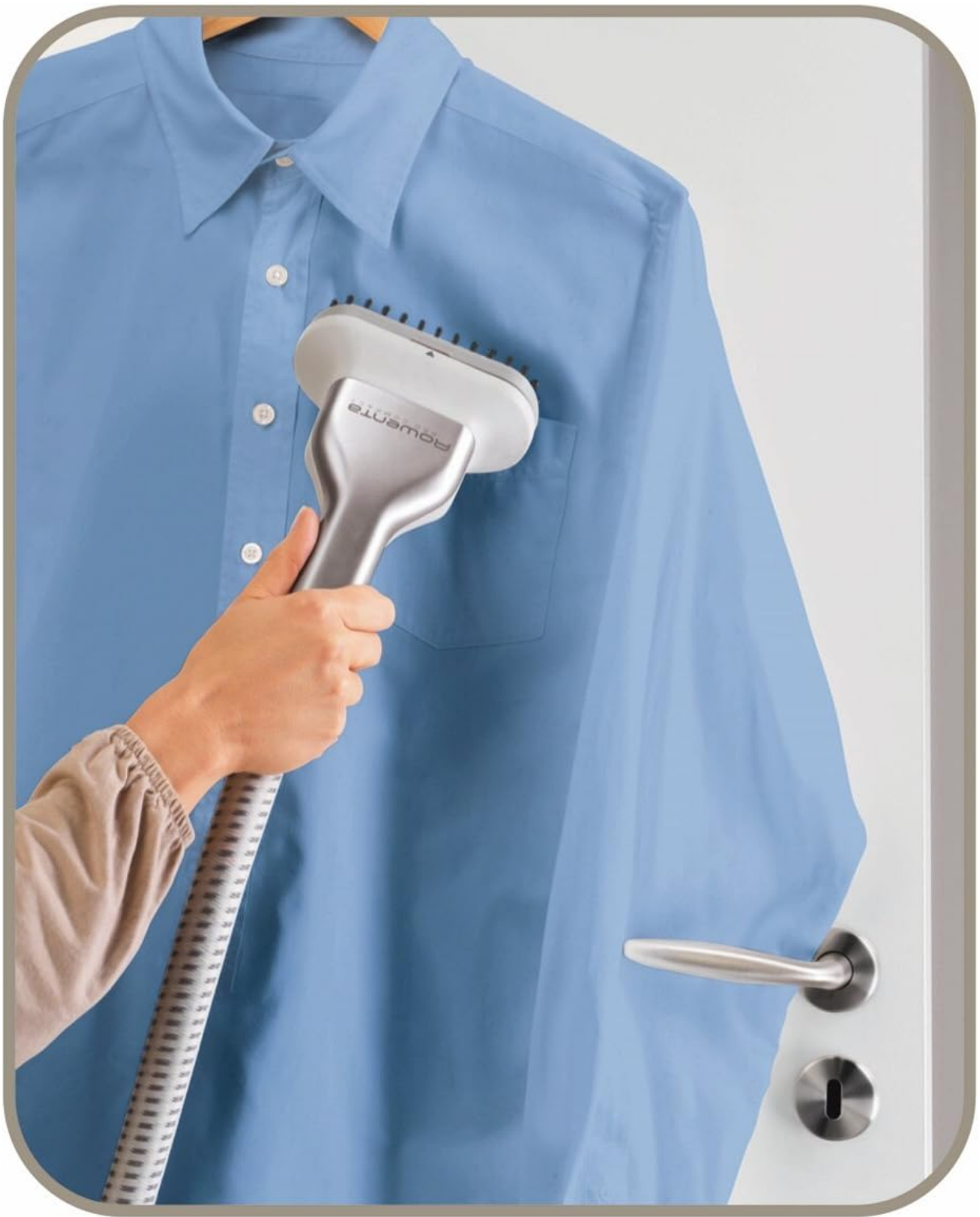
Image: A user demonstrating steaming a blue shirt hung on a door using the steamer.