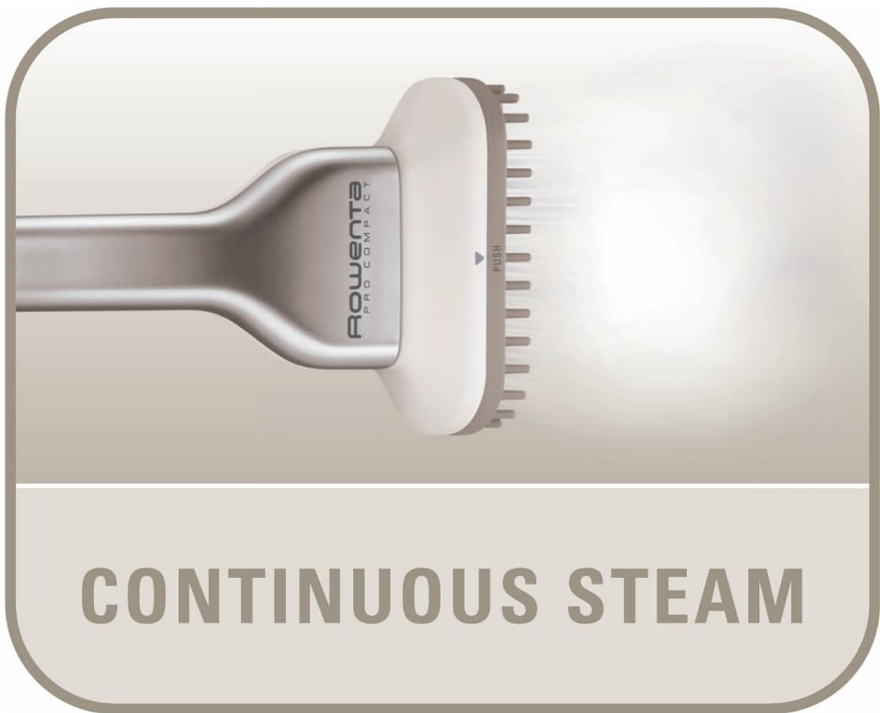
Image: A close-up view of the steamer head, highlighting its continuous steam output.