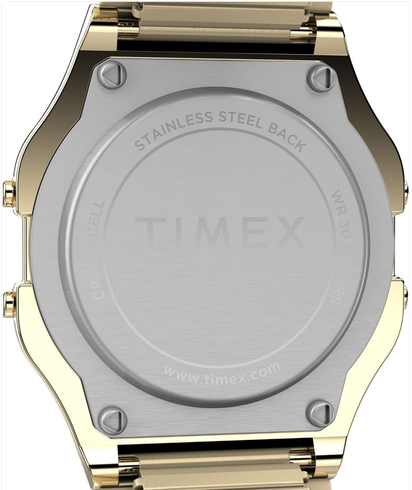
Rear view of the watch, showing the stainless steel back plate.