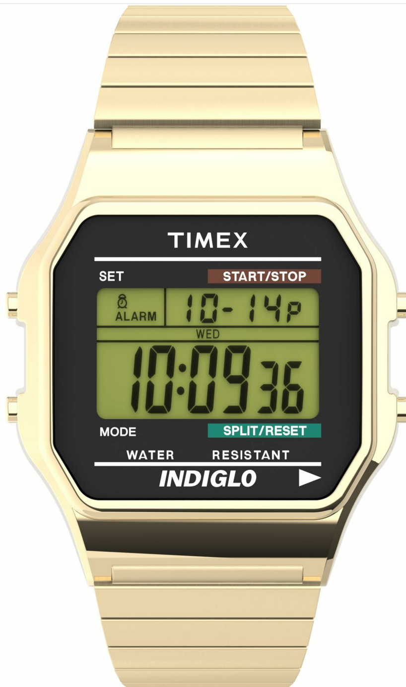
Front view of the Timex Classic Digital 34mm Watch, showcasing its gold-tone finish and digital display.