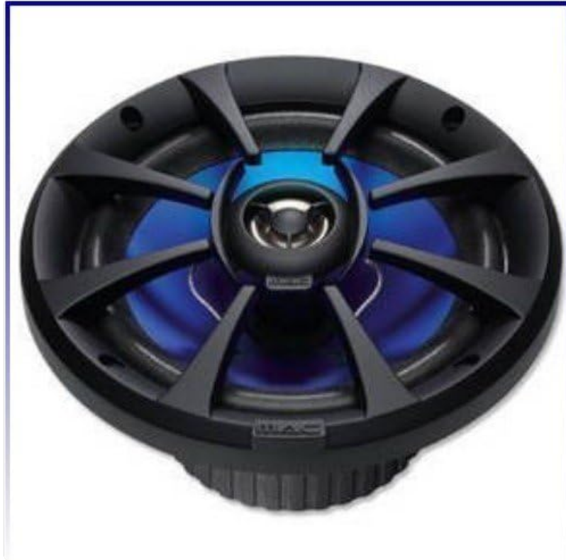
An image showing the front view of the MAC AUDIO Premium X 16.2 coaxial car speaker. The speaker features a black frame with a blue cone and a central tweeter, designed for flush mounting in a vehicle.