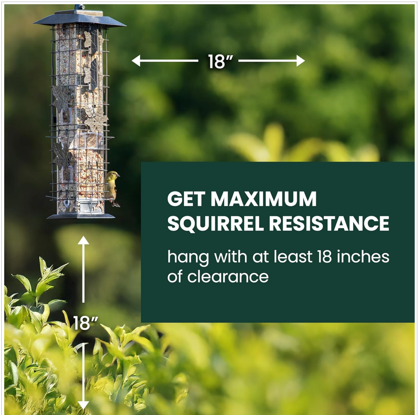
Image: A diagram illustrating the recommended 18-inch clearance for the feeder to maximize squirrel resistance.