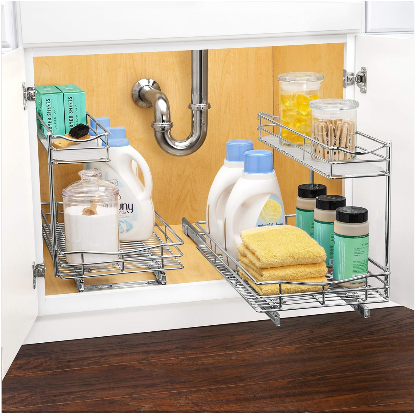
Image: Two LYNK PROFESSIONAL organizers installed side-by-side under a kitchen sink, holding various cleaning products and demonstrating efficient space utilization.