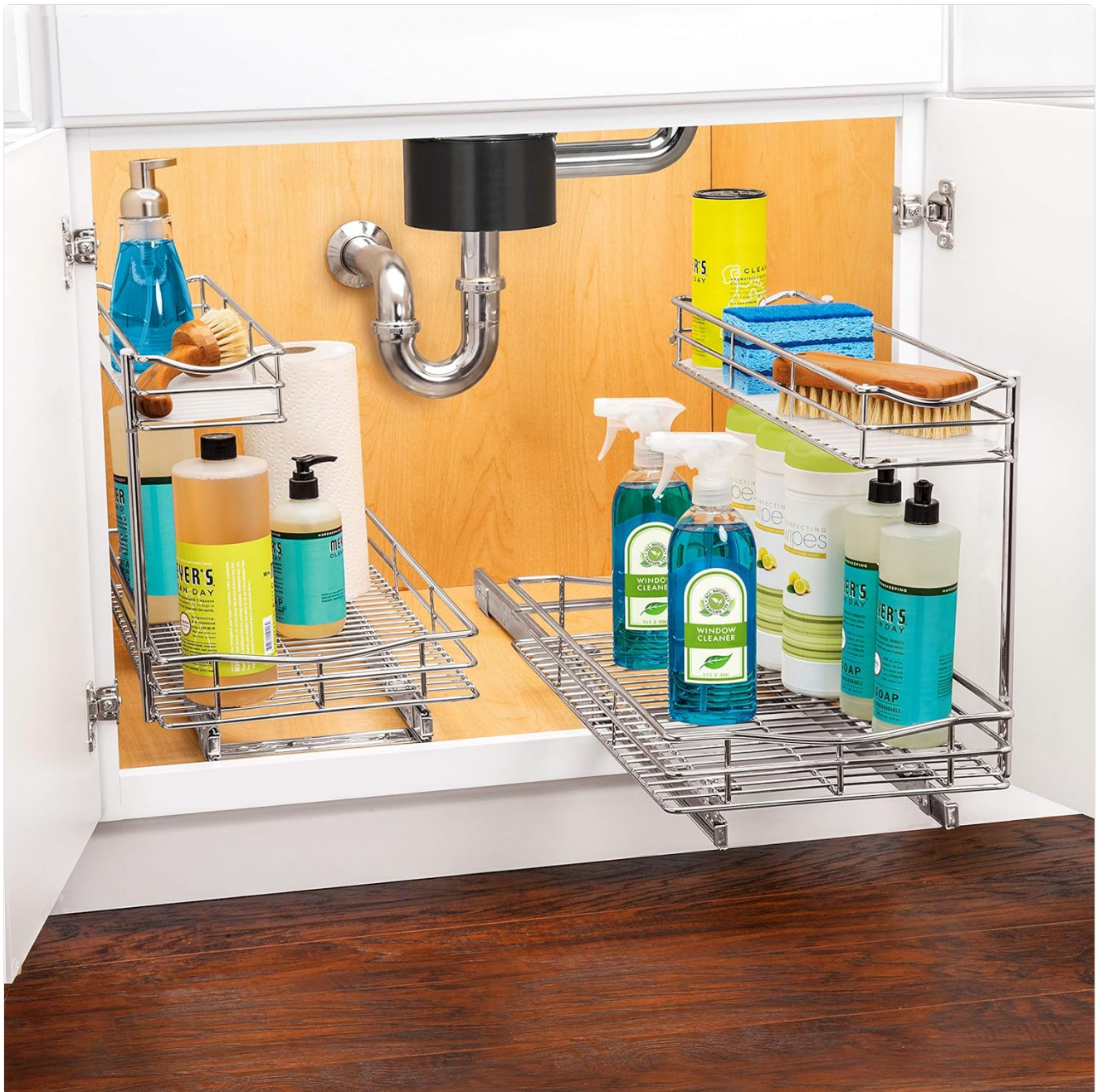
Image: Two LYNK PROFESSIONAL organizers under a sink, showcasing their capacity to hold a variety of household items, from cleaning sprays to brushes.