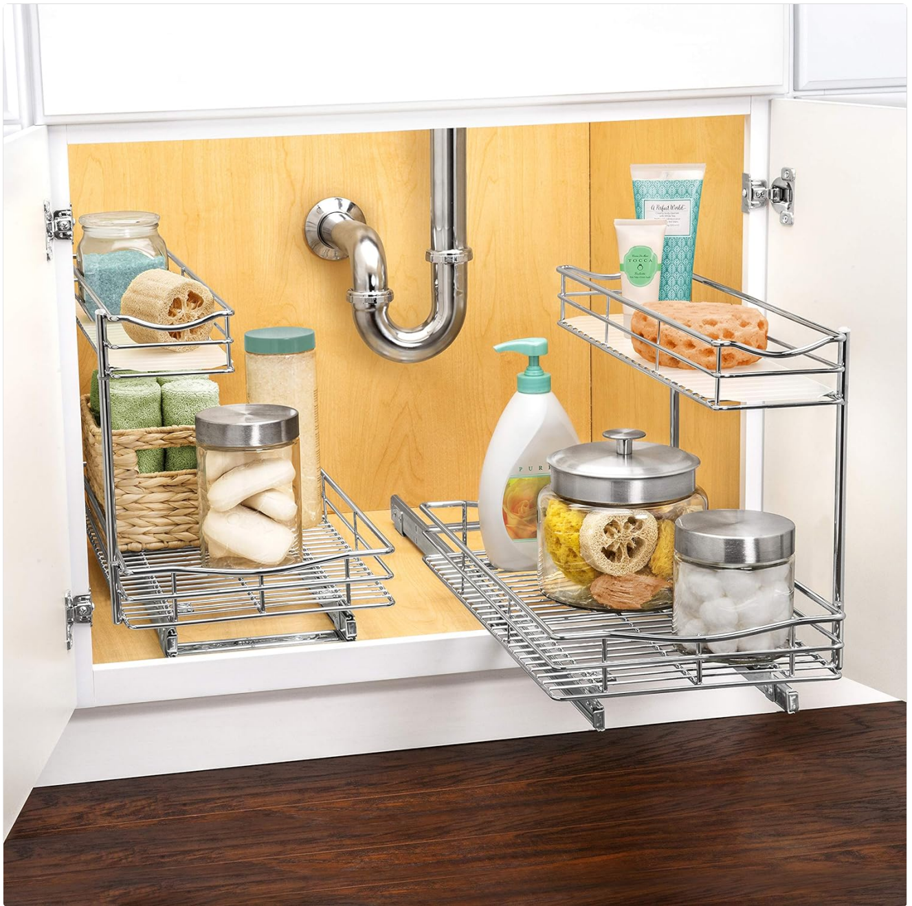
Image: Two LYNK PROFESSIONAL organizers installed under a bathroom sink, storing toiletries and bath accessories, highlighting their versatility.