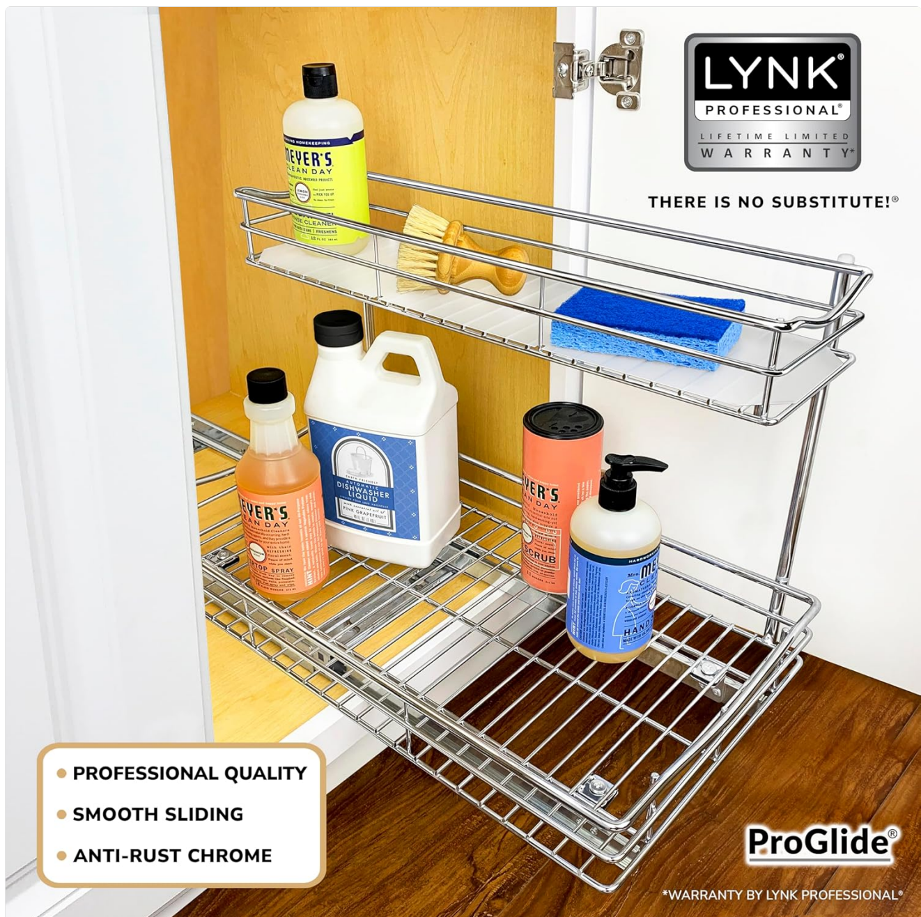
Image: The LYNK PROFESSIONAL Pull Out Under Sink Cabinet Organizer shown installed and pulled out, organizing various cleaning supplies under a kitchen sink.