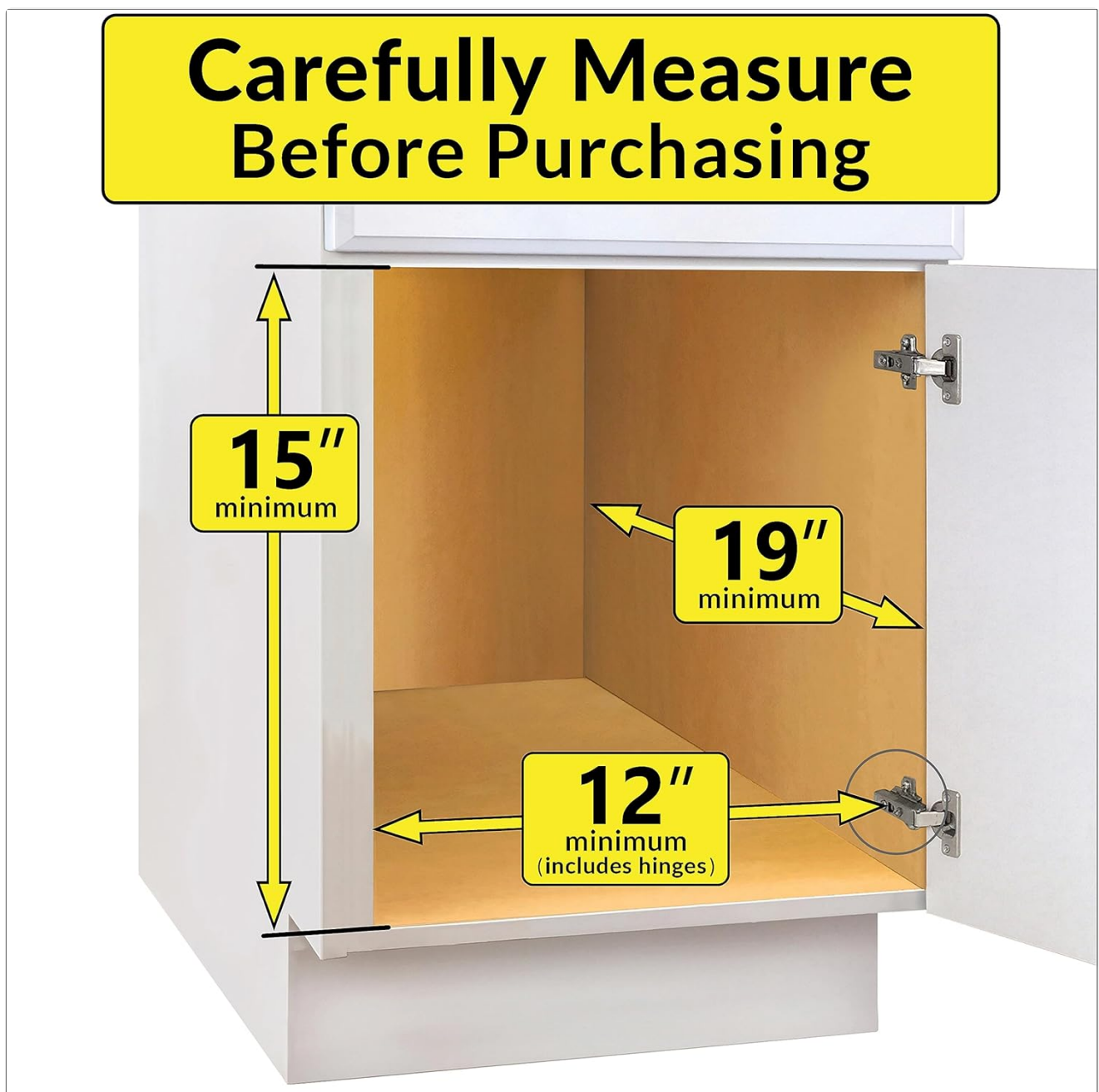
Image: Diagram illustrating minimum cabinet dimensions required for installation: 15" minimum height, 19" minimum depth, and 12" minimum width (including hinges).