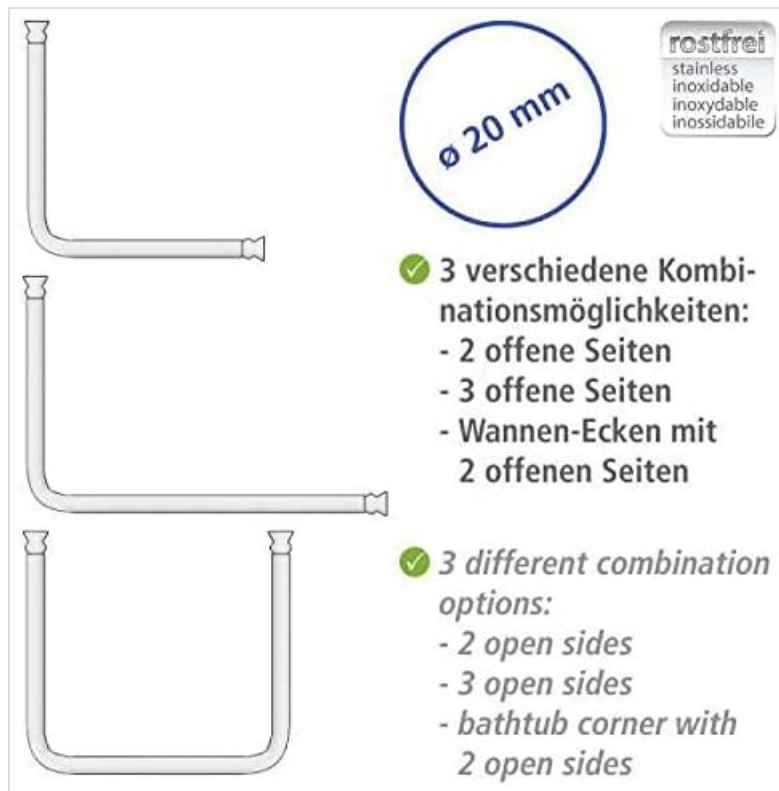
Image: Overview of the three possible shower rod configurations.