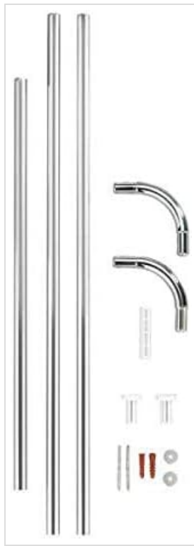
Image: All components included in the package for the WENKO Universal Corner Shower Rod.