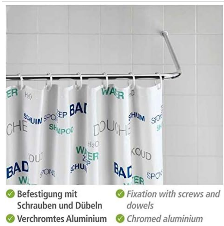
Image: Example of the shower rod installed with screws and dowels, featuring its chromed aluminum construction.