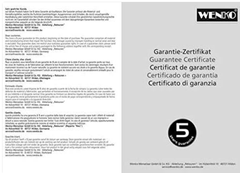
Image 7.1: WENKO 5-year warranty certificate. This image shows a multi-language document titled "Garantie-Zertifikat / Garantie Certificate" with a prominent "5 Years Guarantee" logo.

For warranty claims, please retain your proof of purchase. For further details or to initiate a claim, please contact WENKO customer service. You may be required to return the product along with the corresponding receipt.