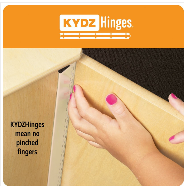
Figure 3: Detail of KYDZ Hinges, engineered to protect small fingers from being pinched.