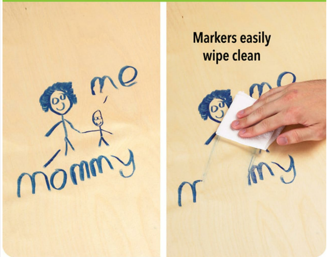
Figure 7: The KYDZ Tuff finish, showing how easily marks can be wiped away.