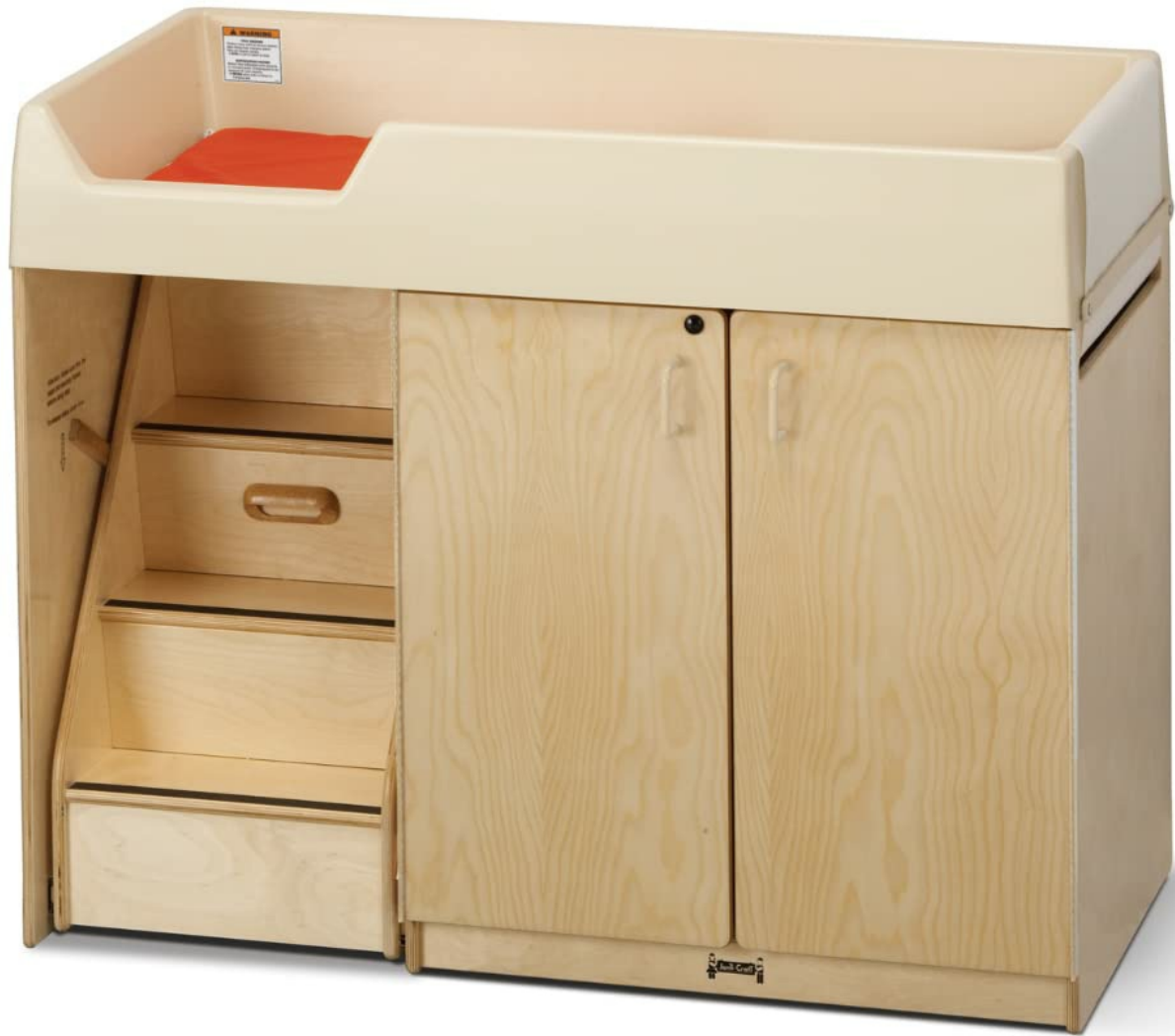
Figure 1: Overall view of the Jonti-Craft 5145JC Diaper Changer with Stairs, Left.