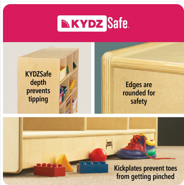
Figure 2: Illustration of KYDZ Safe features, highlighting rounded edges and kickplates for child safety.