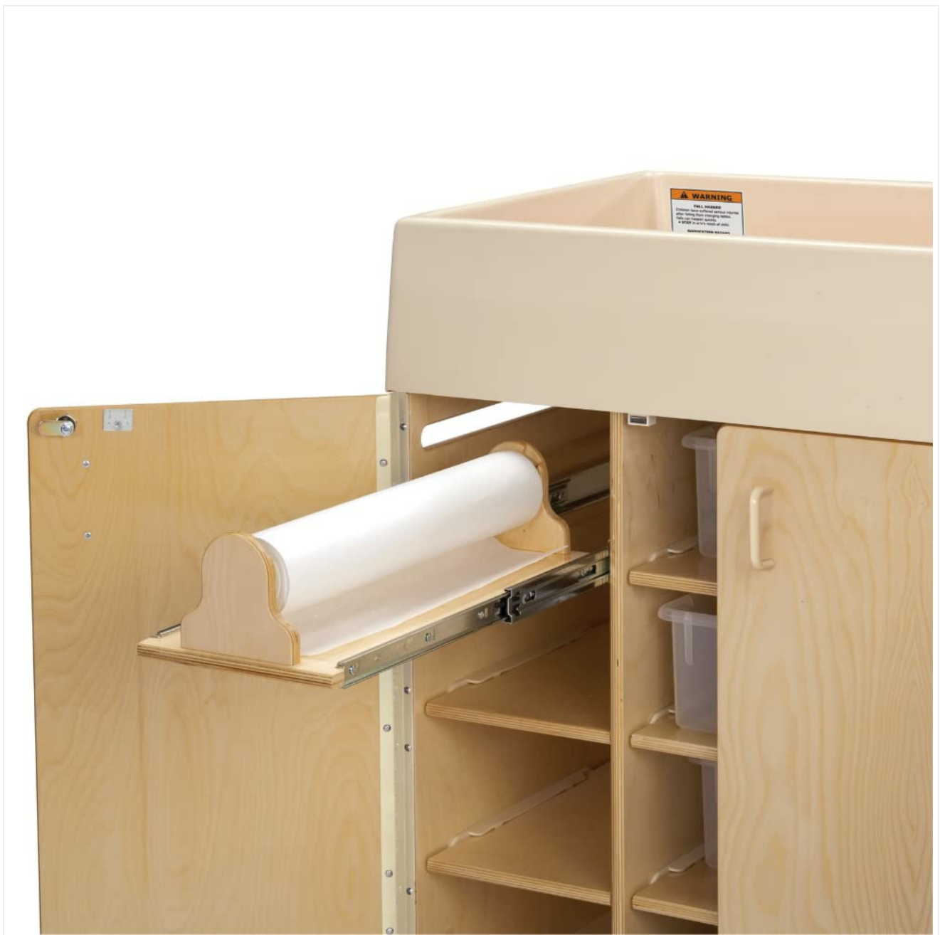
Figure 6: The pull-out paper dispenser, designed for convenient access to paper rolls.