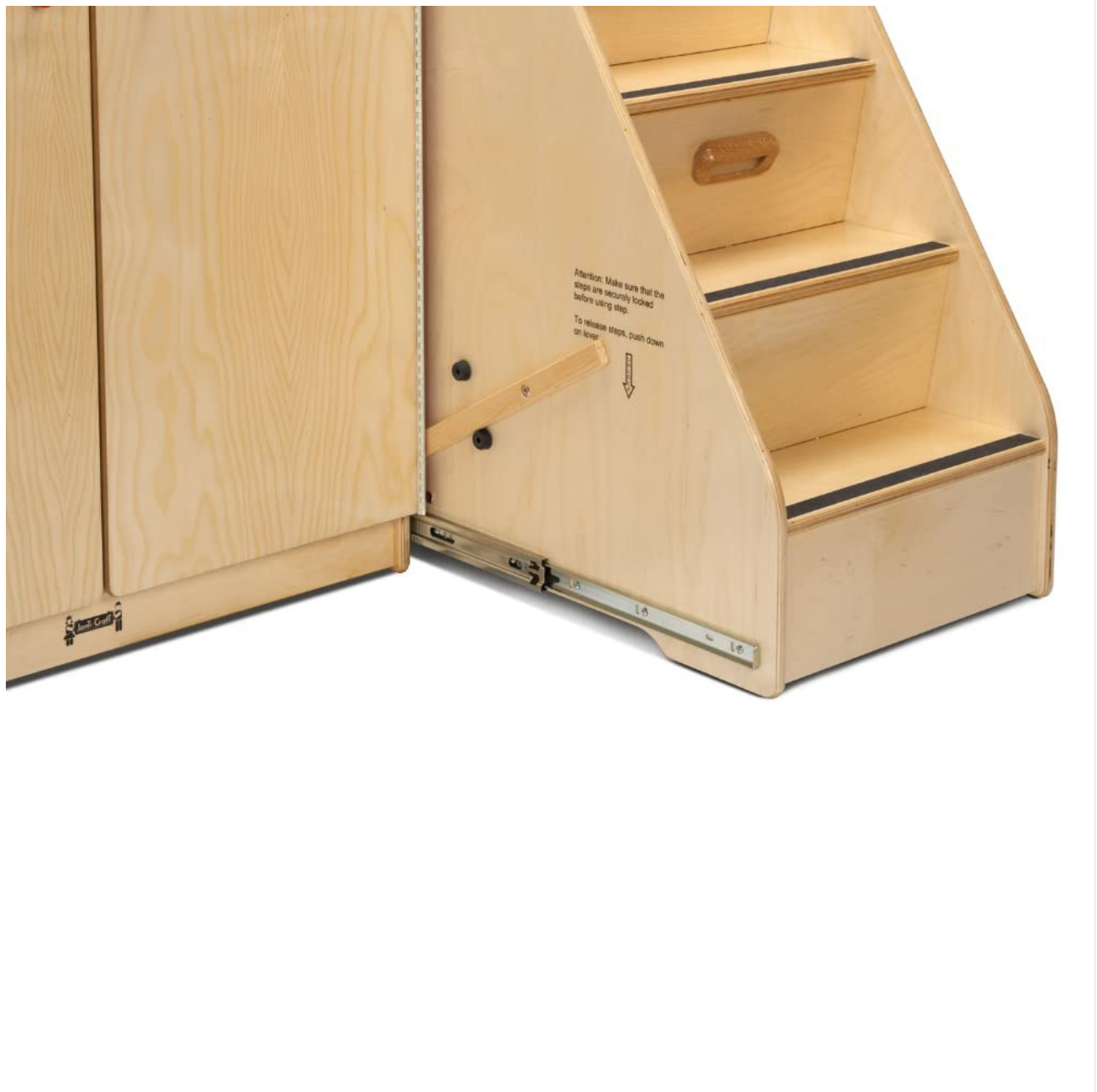
Figure 4: Close-up of the stair lever for extending and retracting the stairs.

The unit features glide-out stairs on the left side, designed for easy access for children. To extend the stairs, gently pull them out until they lock into place. Ensure the stairs are securely locked before a child uses them. To retract the stairs, push down on the lever located near the top step and slide the stairs back into the unit. This helps save space and prevents unsupervised access.