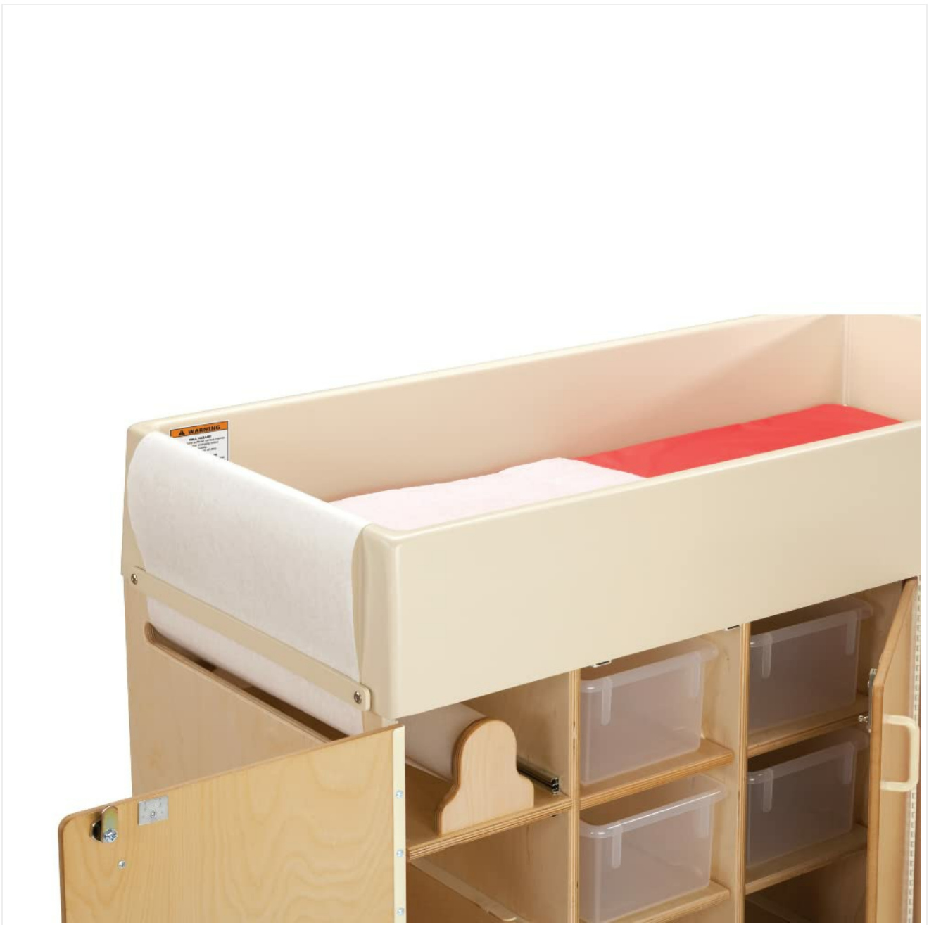
Figure 5: The changing surface with the changing pad and protective deep rails.