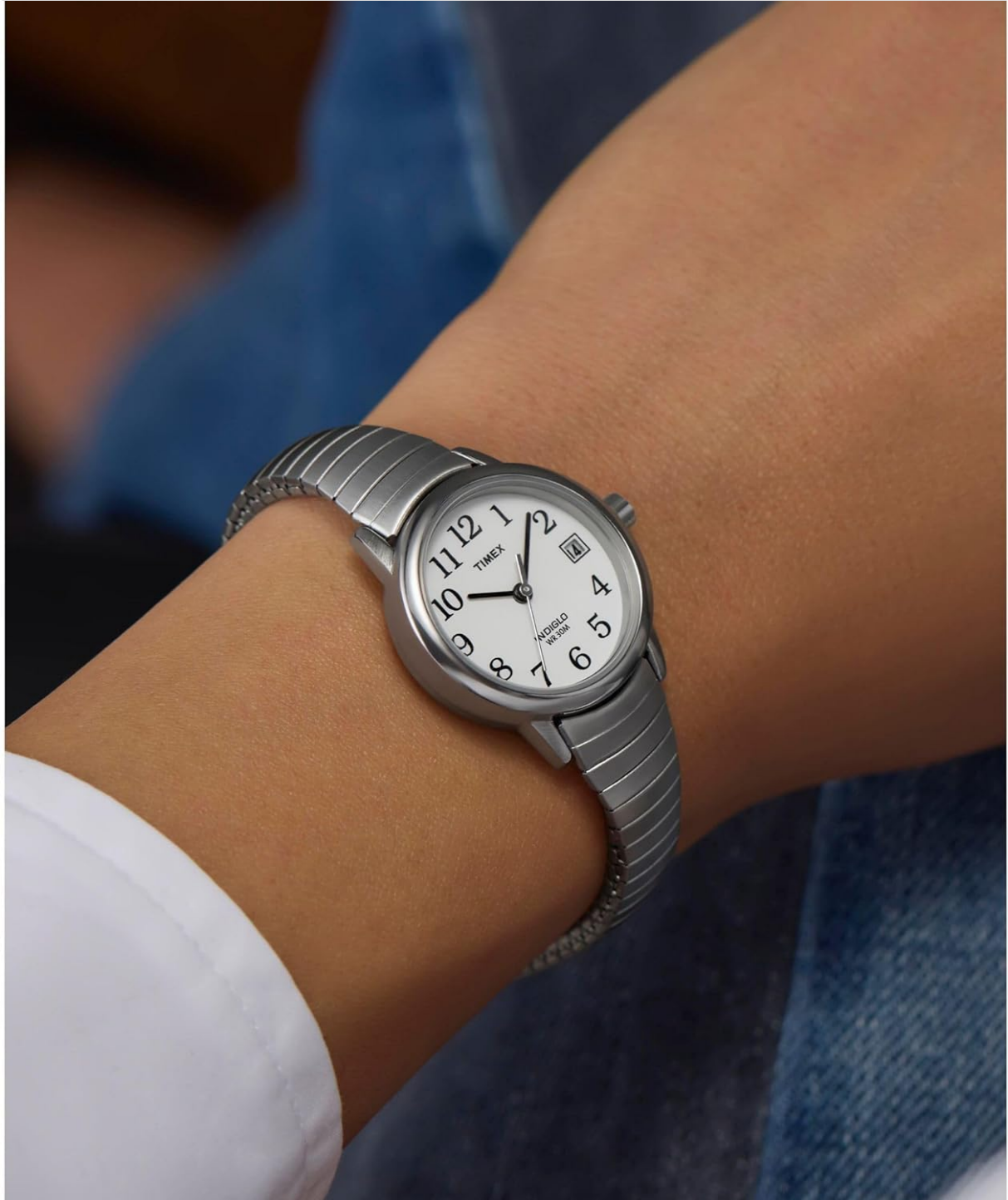
Figure 3: The watch worn on a wrist, demonstrating the fit of the expansion band.

This watch features a stainless steel expansion band designed for easy slip-on comfort. The band is self-adjusting to fit most wrist sizes up to 7.5 inches. No manual adjustment or tools are typically required for sizing.