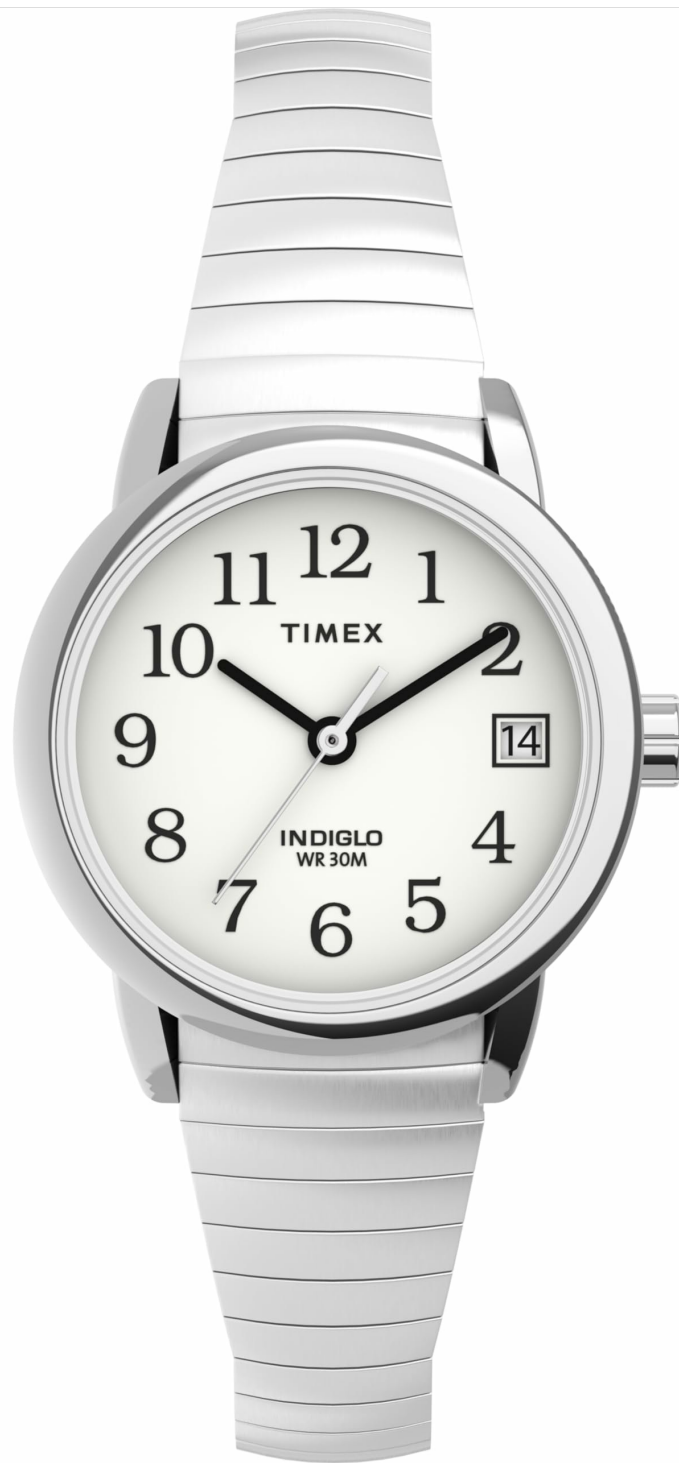
Figure 1: Front view of the Timex Women's Easy Reader 25mm Watch.