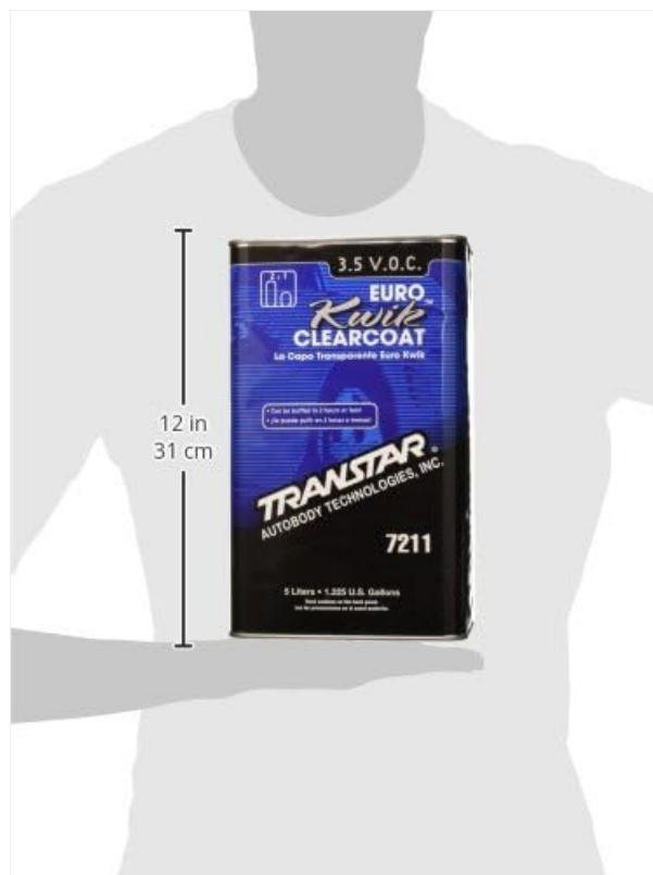
Image: The TRANSTAR 7211 Euro Kwik Clear Coat can with overlaid measurements, indicating a height of 12 inches (31 cm).