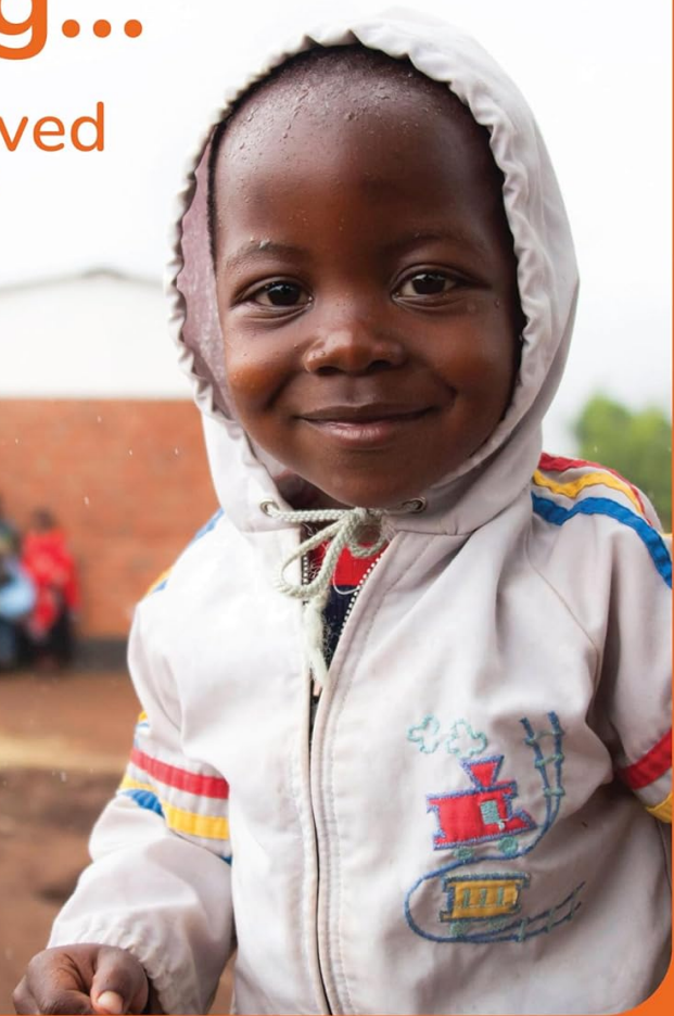
Image: A child smiling, representing NOW Foods' long-standing mission and partnership with Vitamin Angels to provide essential nutrients.