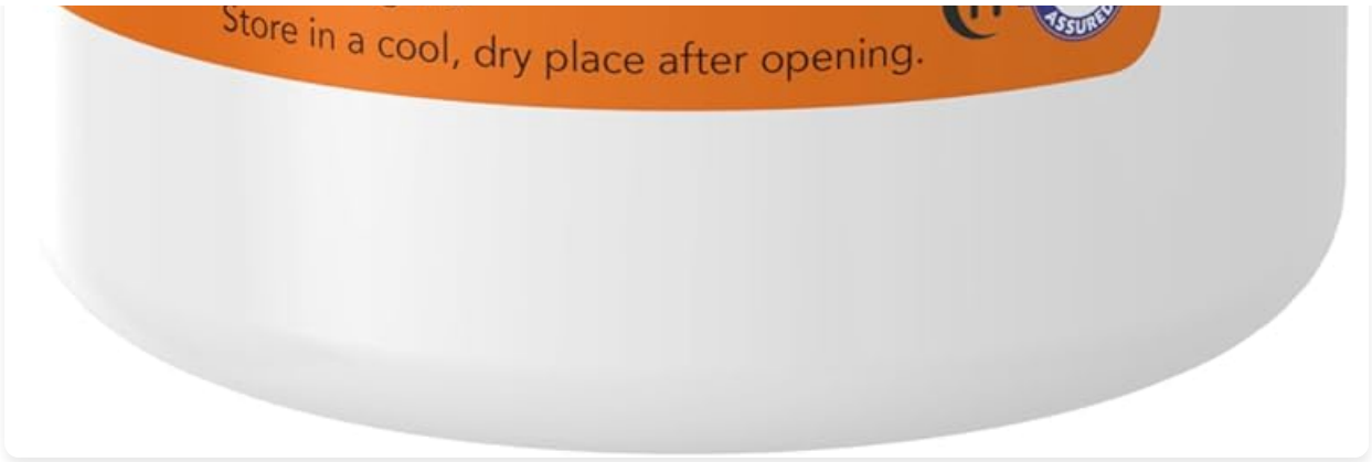
Image: Rear view of the NOW Foods Acetyl-L Carnitine bottle, showing the Supplement Facts panel with detailed ingredient information and serving size.