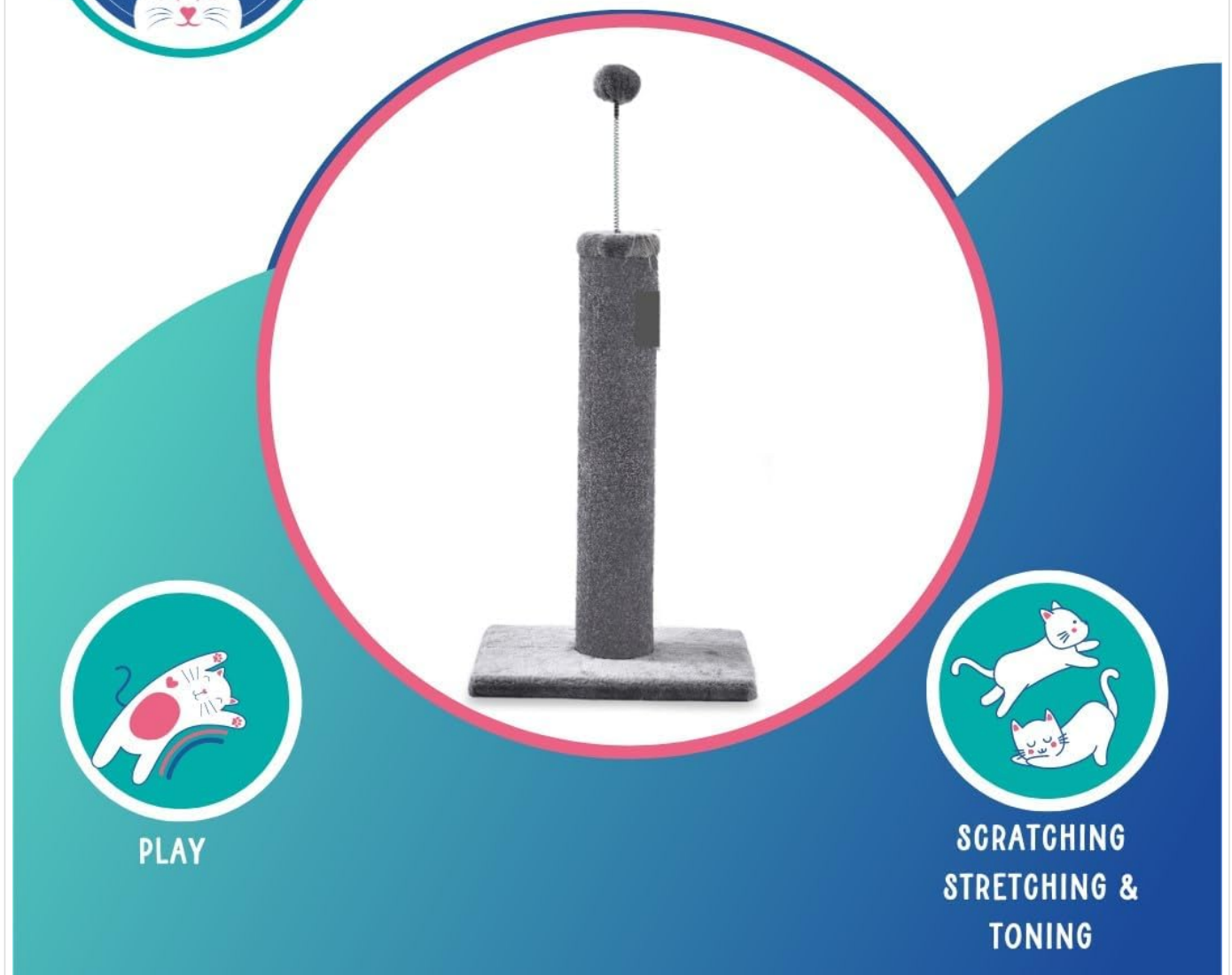
Figure 3: Benefits of the scratching post, including play, scratching, stretching, and toning for your cat.