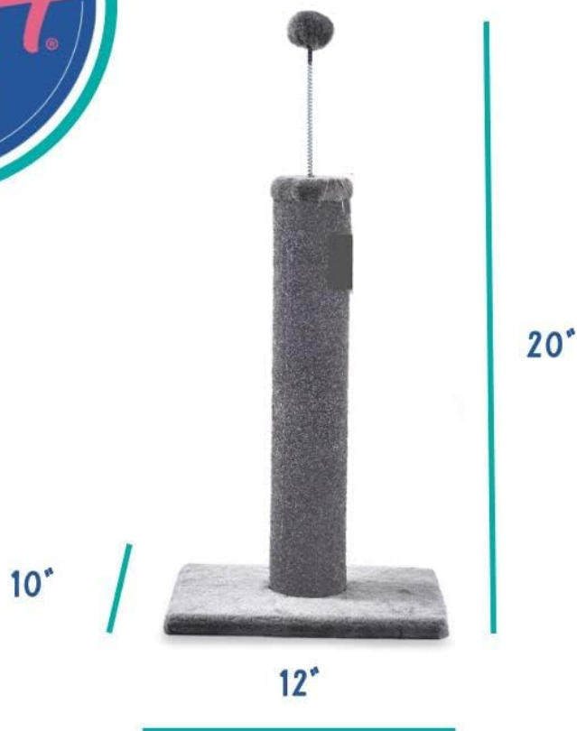
Figure 1: Product Dimensions. The scratching post measures approximately 12 inches (L) x 10 inches (W) x 20 inches (H).