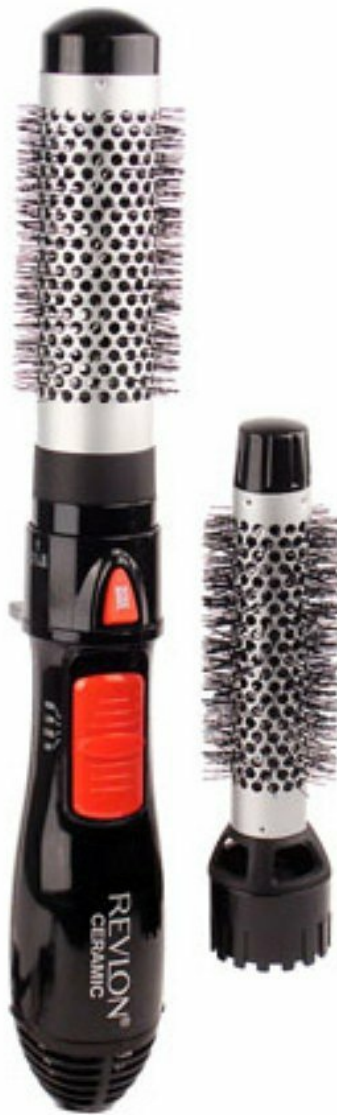
Image: The Revlon All-In-One Style Hot Air Kit, showcasing the main unit and the two interchangeable ceramic-coated barrels.