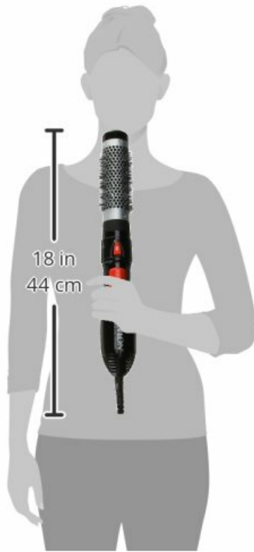
Image: The Revlon Hot Air Brush held by a person, illustrating its approximate size and ergonomic design for user reference.