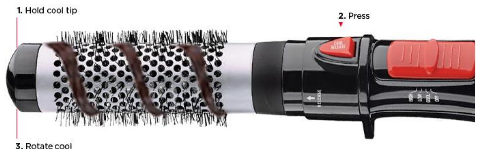
Image: Instructions for using the curl release button to untangle hair from the barrel.