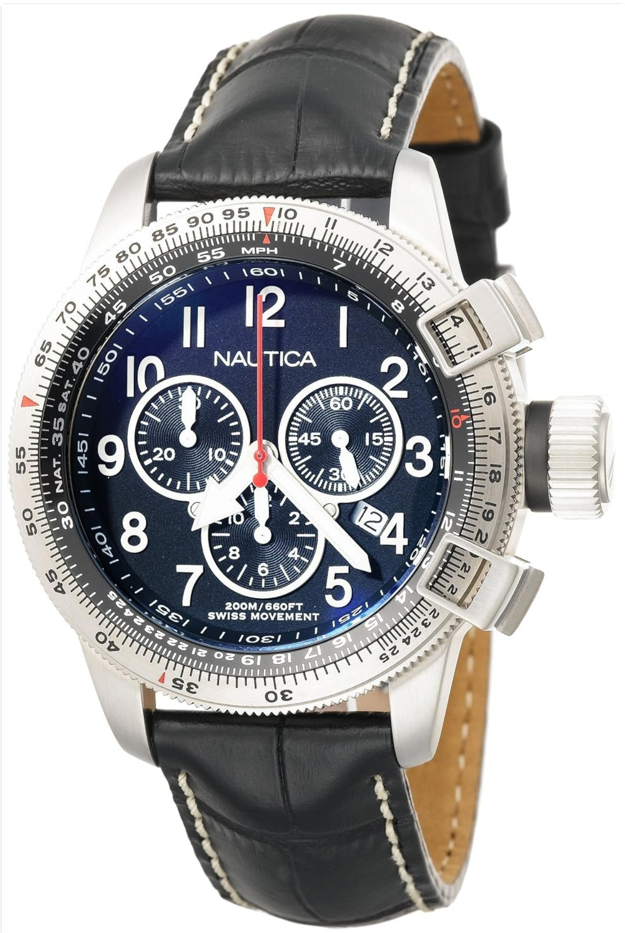
Image 1: Front view of the Nautica Men's N22503 BFC Chronograph Watch, featuring a blue dial, three subdials, and a black leather strap with white stitching.