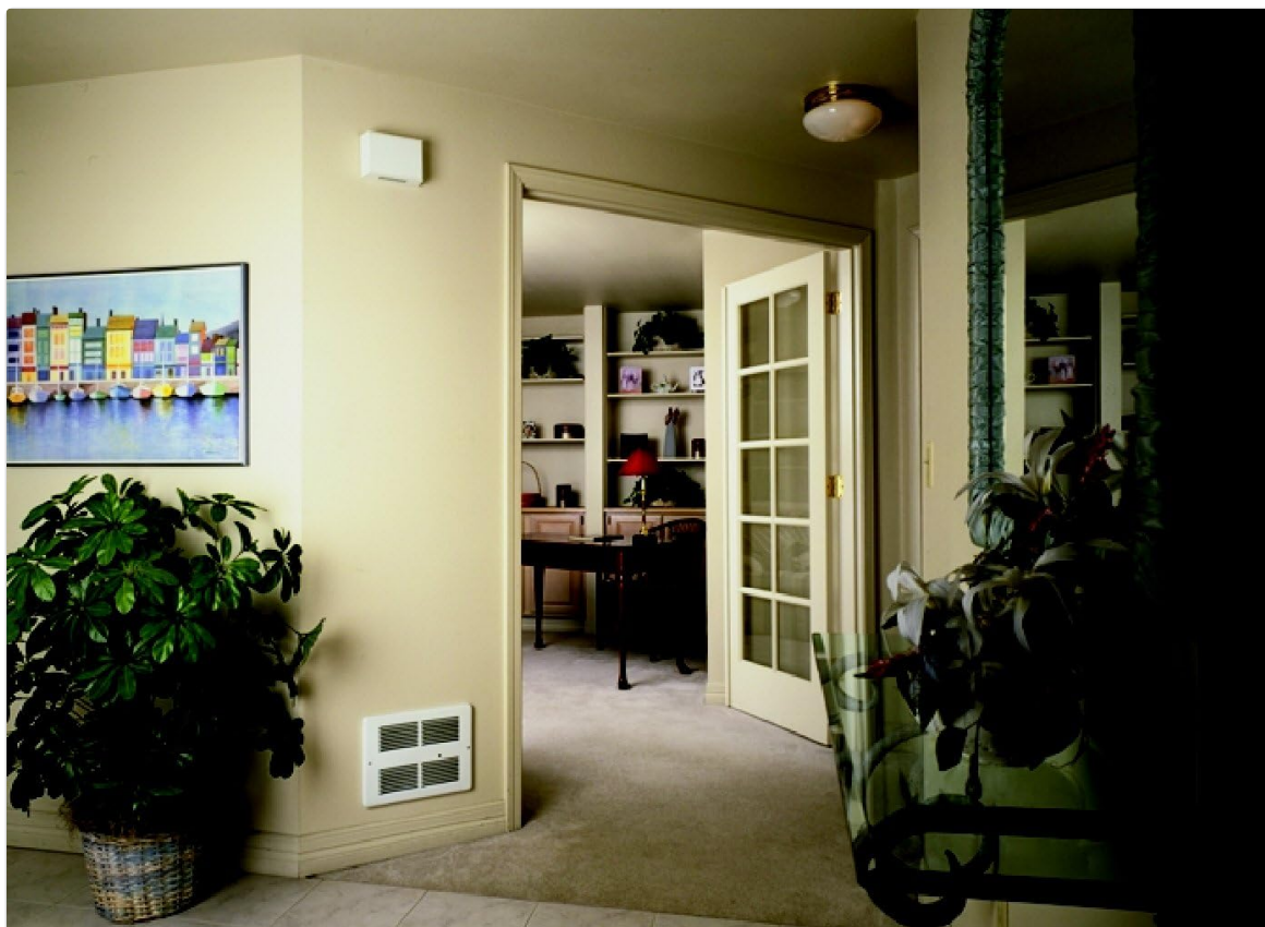
Figure 1.1: King WHF1210-W Wall Heater installed in a residential setting, providing discreet heating.

The King WHF1210-W is a fan-forced wall heater designed for efficient spot heating in small rooms, apartments, bathrooms, and utility areas. This unit offers a compact and integrated heating solution, eliminating the need for bulky space heaters. It features two wattage options, 500W and 1000W, capable of heating areas up to 100 square feet. The design integrates seamlessly into your wall, resembling a standard central heating system register. For enhanced safety, the heater includes "Smart Limit Protection" which automatically shuts off the unit if it overheats.