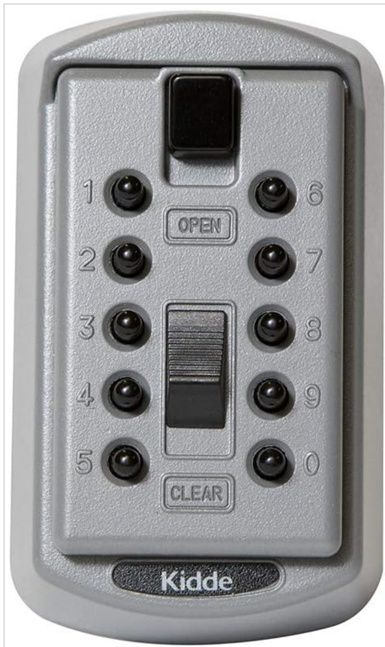
Image 1: Front view of the Kidde AccessPoint 001170 KeySafe lock box, showing the push-button keypad and the 'OPEN' and 'CLEAR' buttons. The lock box is titanium gray.