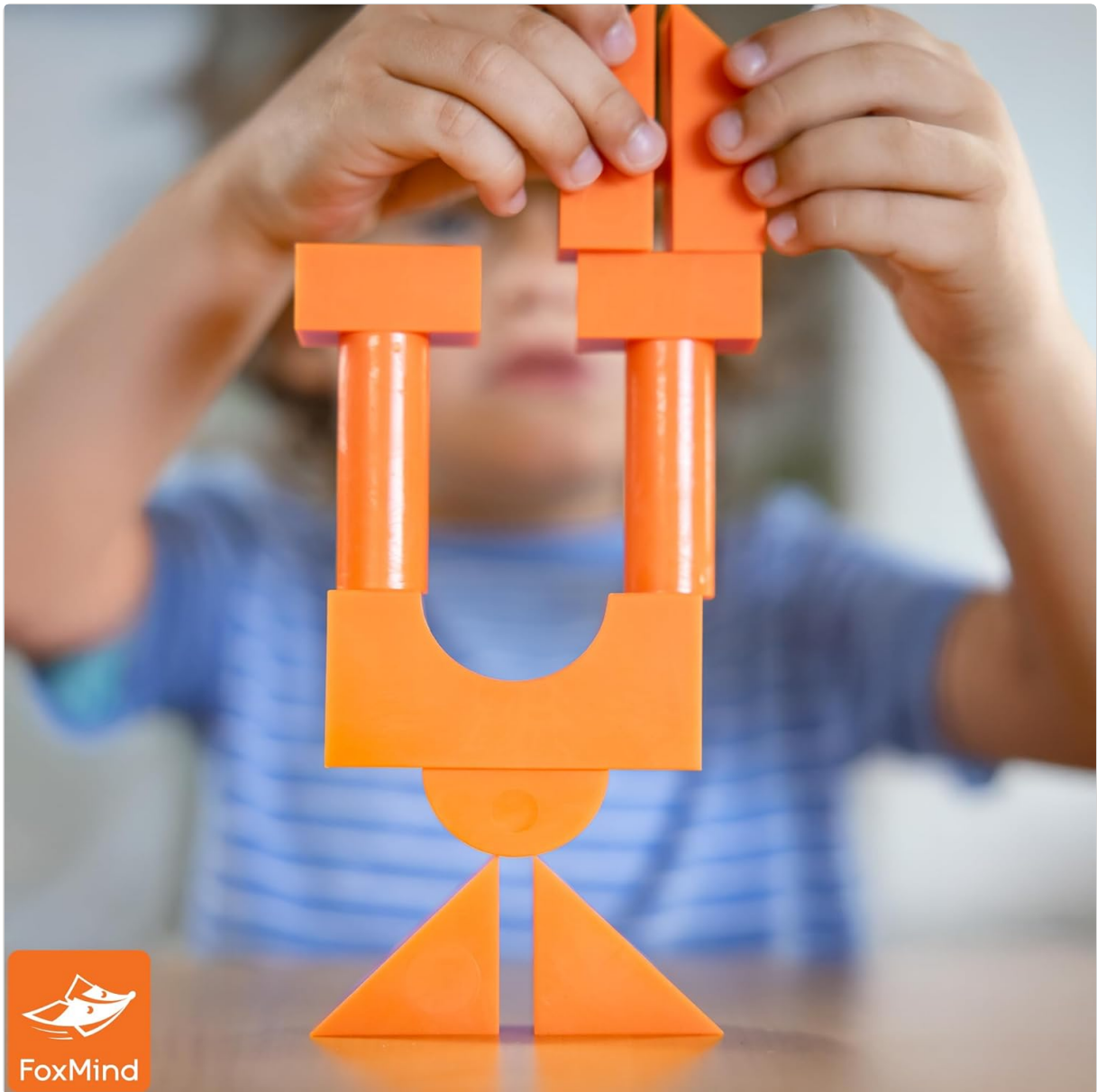
Image 2: Equilibrio game components, including GeoBlocks and the puzzle booklet.