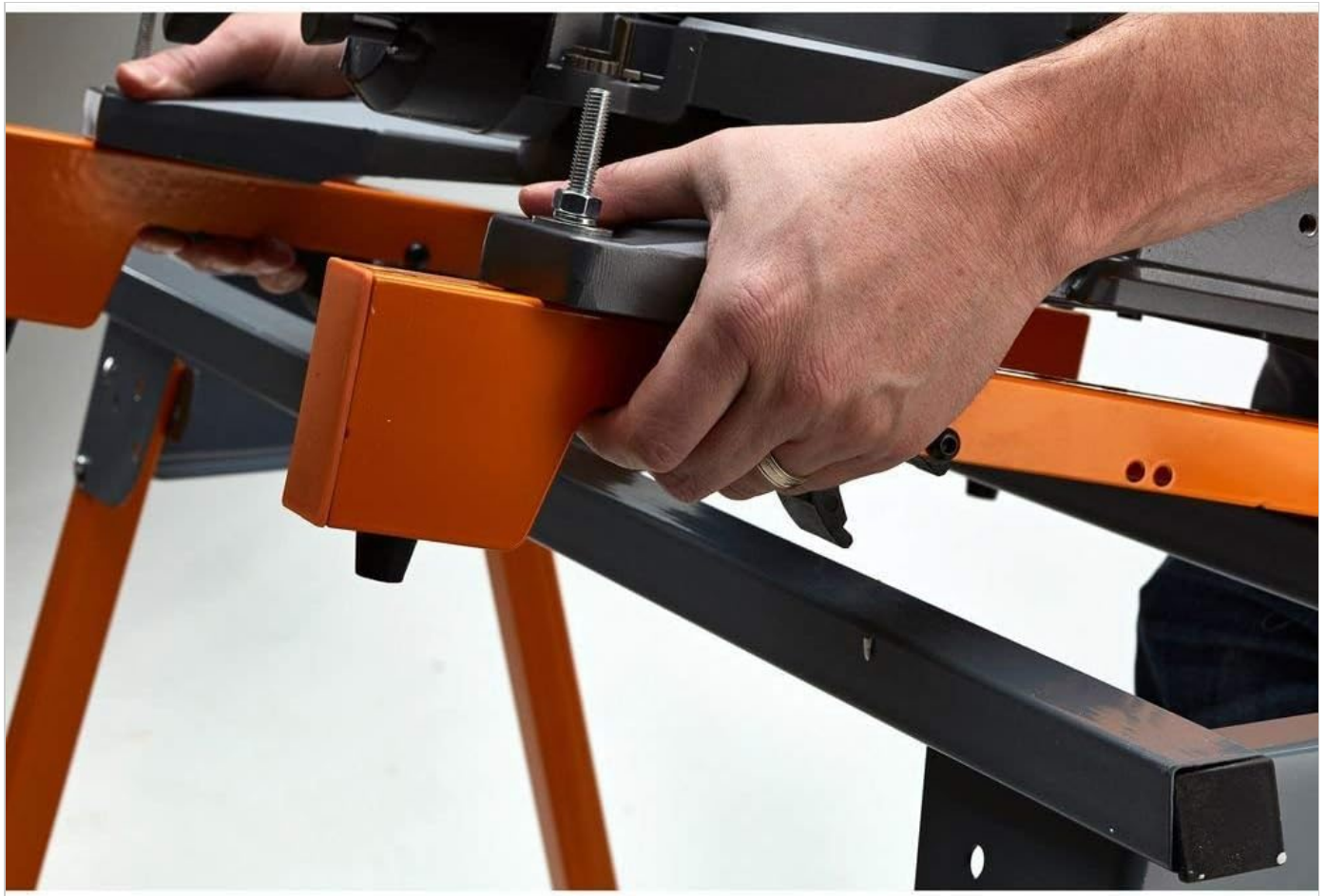
Image: Securing the PM-7002 tool mount to a power tool. This image shows a hand tightening a bolt to attach the orange mount to the grey base of a miter saw, which is already positioned on a work stand.