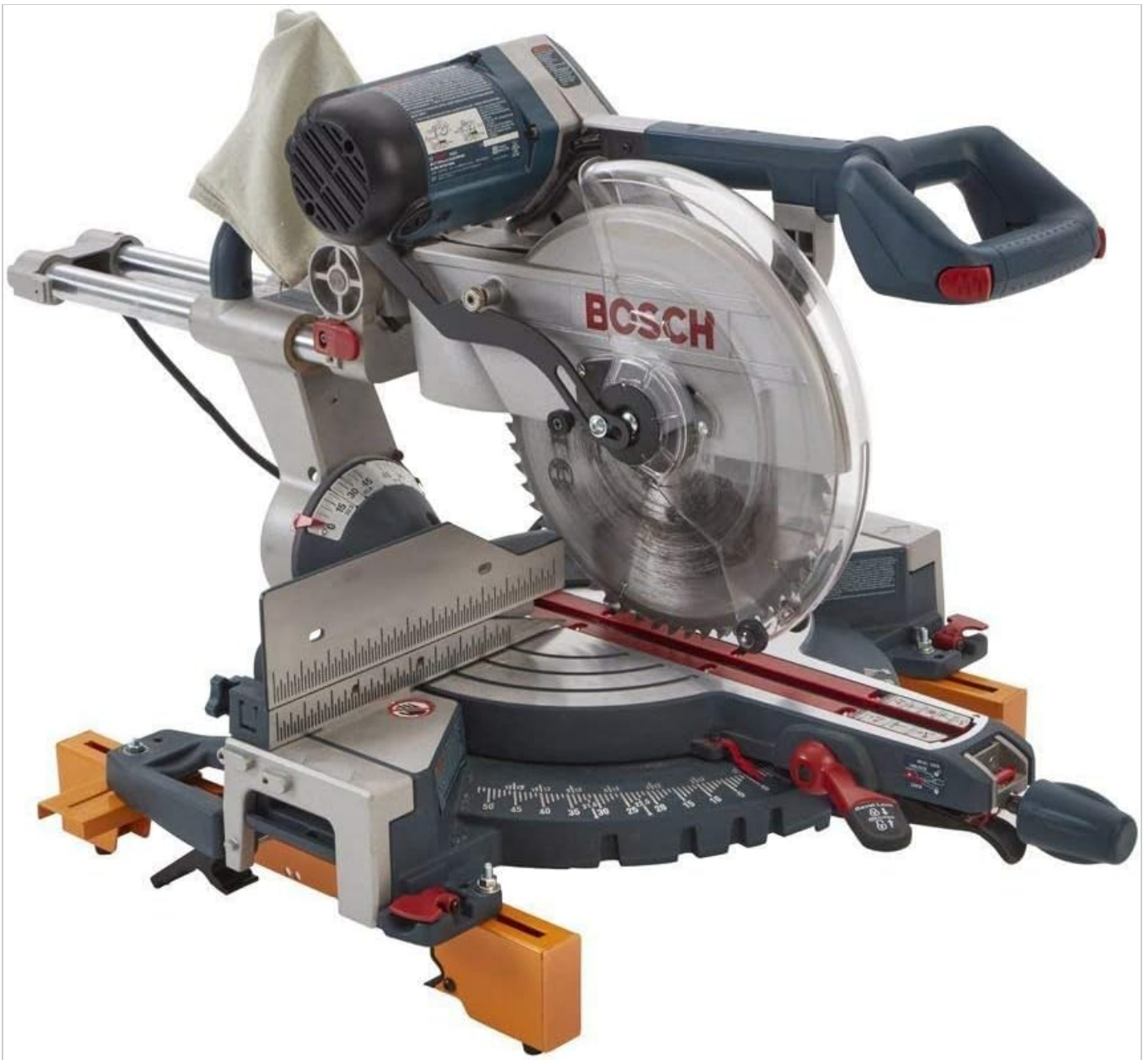
Image: A miter saw mounted on a Portamate stand. This image shows a Bosch miter saw fully installed and ready for use on a Portamate work stand, demonstrating the secure fit of the tool mounts.