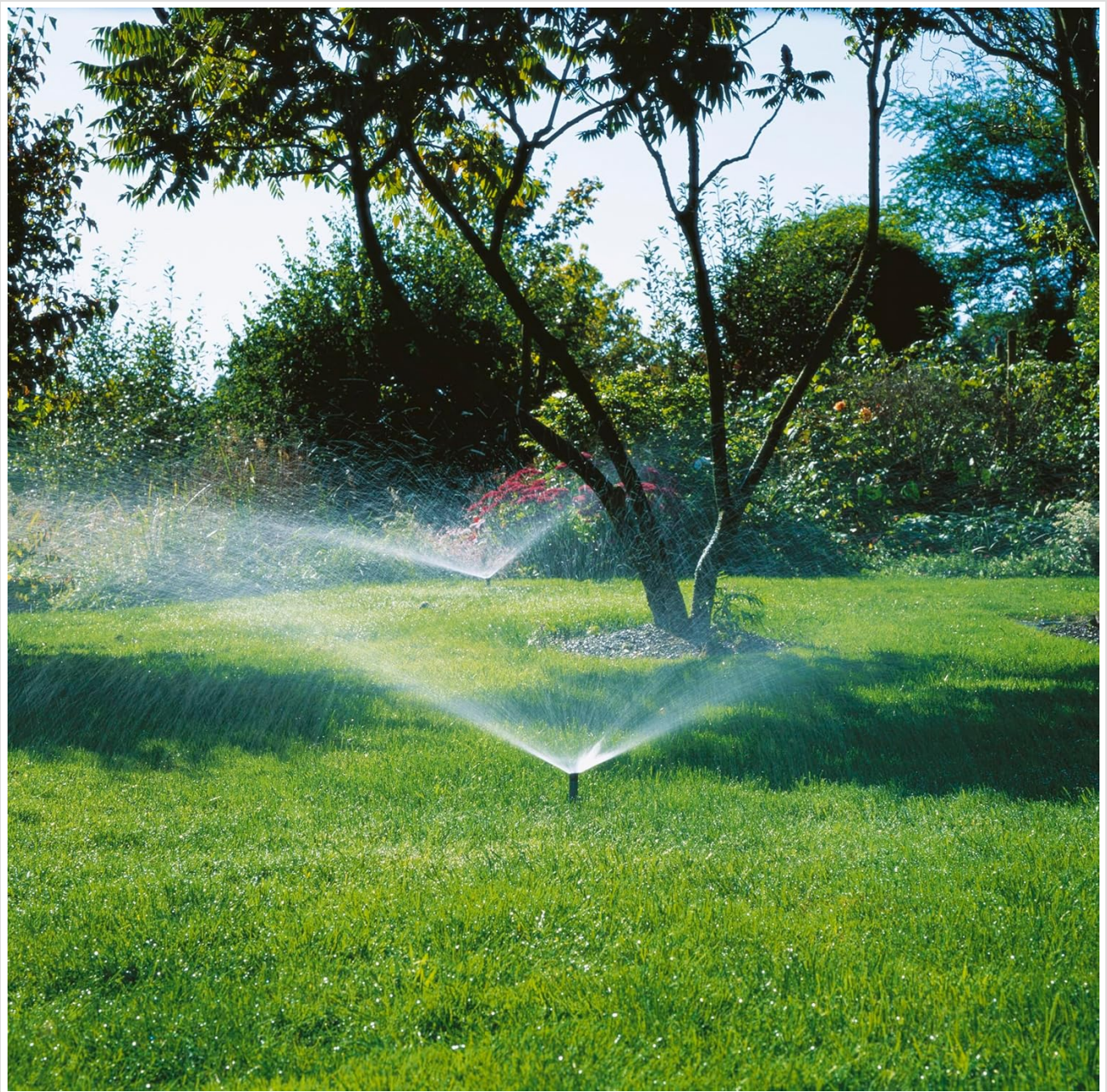
Image 3: A close-up view of the GARDENA Pop-Up Sprinkler distributing water.