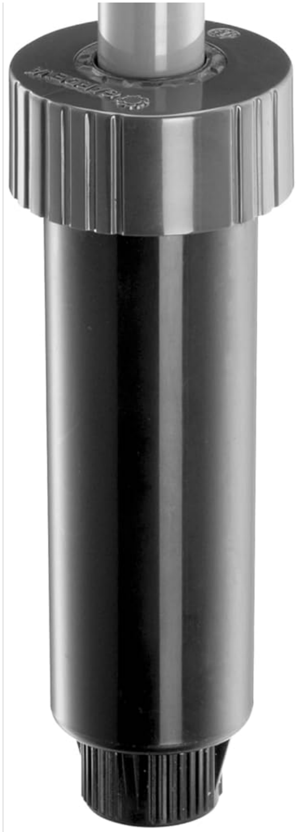
Image 2: GARDENA Pop-Up Sprinklers in operation, watering a lawn area.