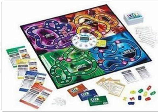
Image: All game components, including the board, LIFEPod, cards, cars, and pegs, arranged for play.