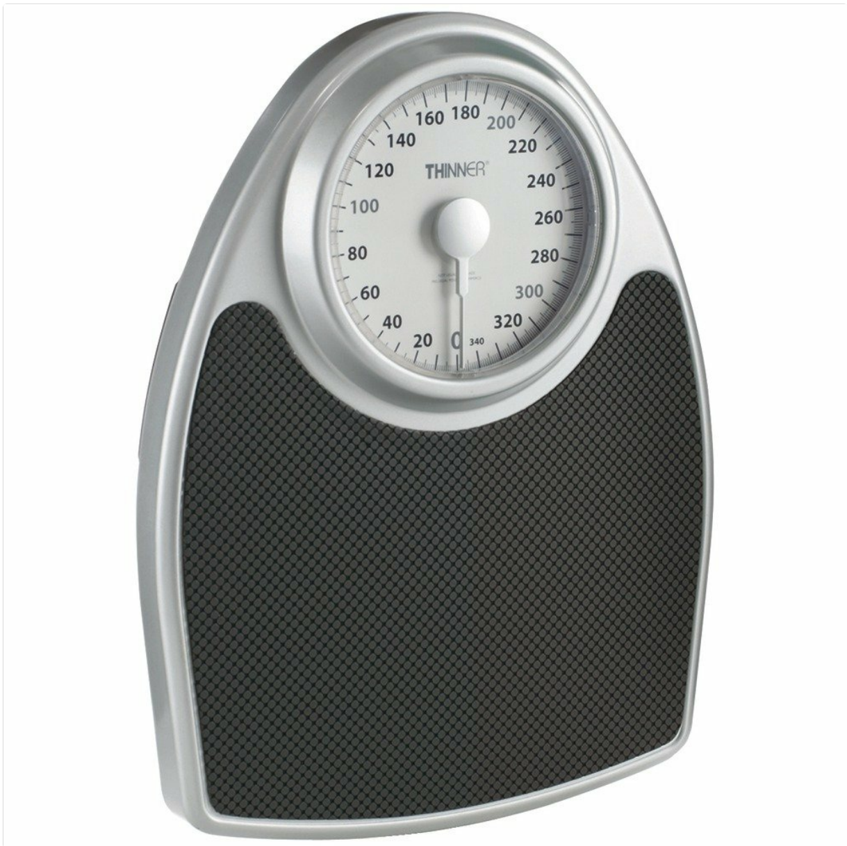
Image: Front view of the Conair Thinner TH100S Analog Bathroom Scale, showcasing its large dial and textured platform.