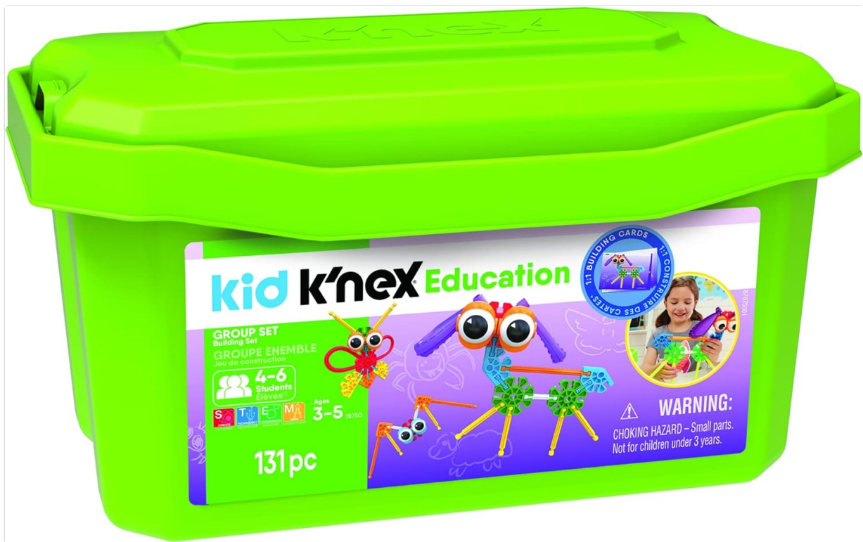
Image 2.1: The K'NEX Education - Kid K'NEX Group Set in its green storage tub.