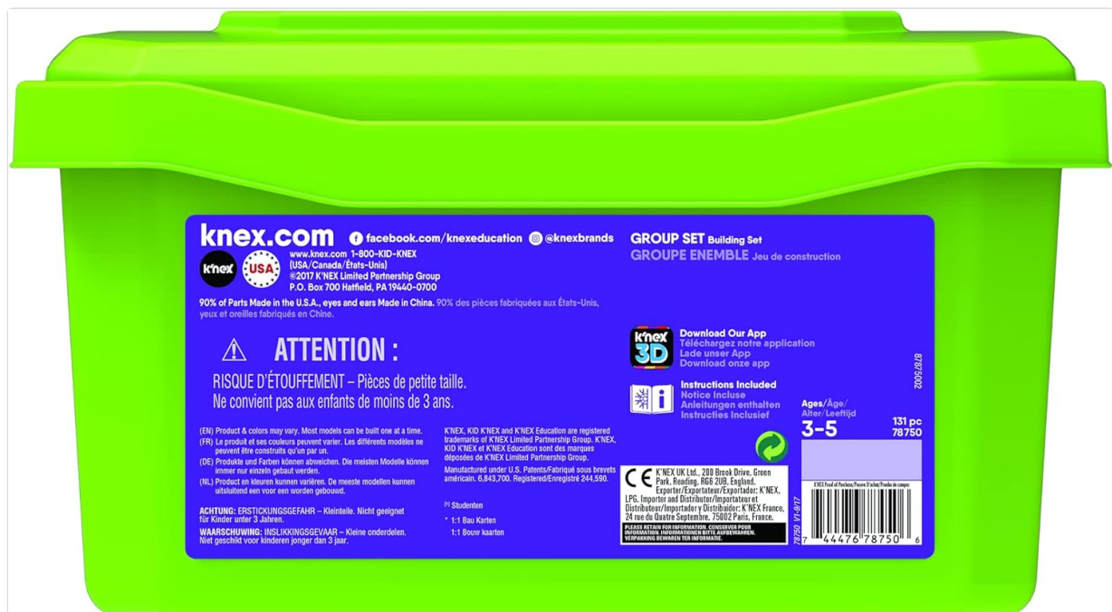
Image 8.1: Back of the product box, displaying manufacturer contact information and other details.