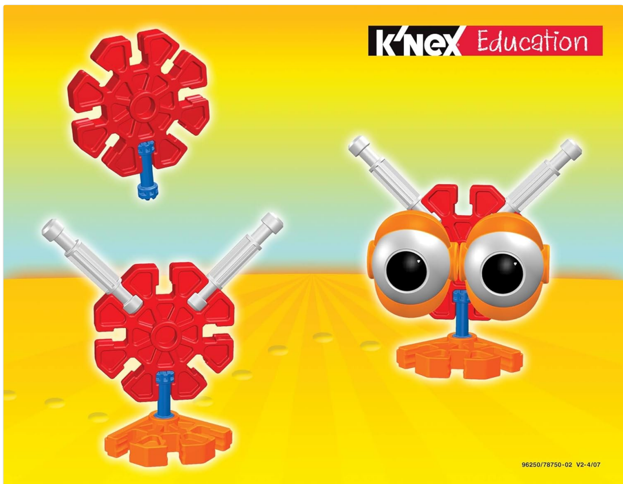
Image 3.2: Example of connecting a blue K'NEX piece with orange rods.