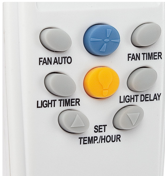
Figure 3: Close-up view of the remote control buttons.