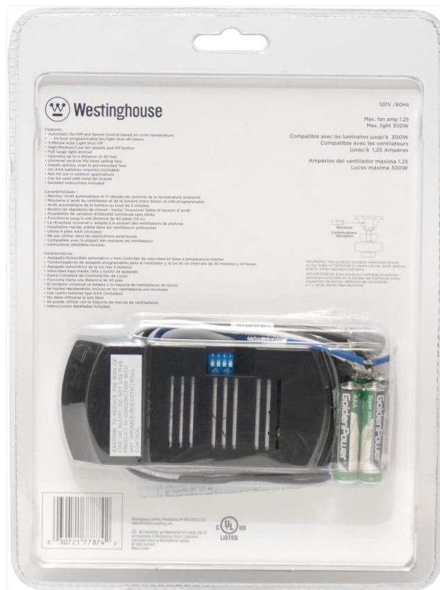
Figure 2: Back view of the packaging, showing the receiver unit and included batteries.

The receiver unit must be wired to the ceiling fan at the ceiling. This process involves connecting the receiver between the fan's wiring and the household electrical wiring. It is recommended that installation be performed by a qualified electrician to ensure safety and proper function. Before beginning, it is advisable to photograph the existing wiring for reference and plan how to fit the receiver and wiring into the fan housing, as it can be a tight fit.