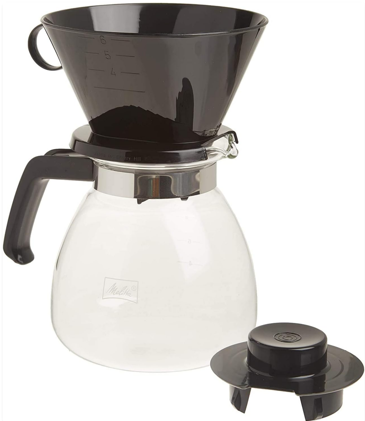
Image: Disassembled components of the Melitta Pour-Over Coffee Maker, showing the glass carafe, black brewing cone, and lid.