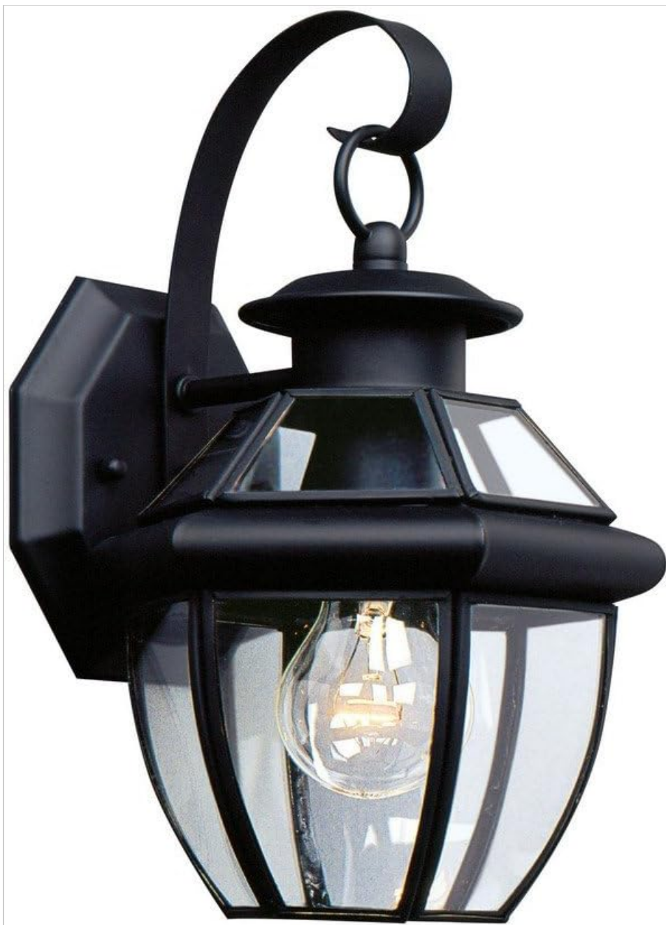
Figure 2: Installed Fixture. This image displays the Sea Gull Lighting Lancaster 8037-12 outdoor wall lantern after installation, showcasing its black finish and clear glass panels.