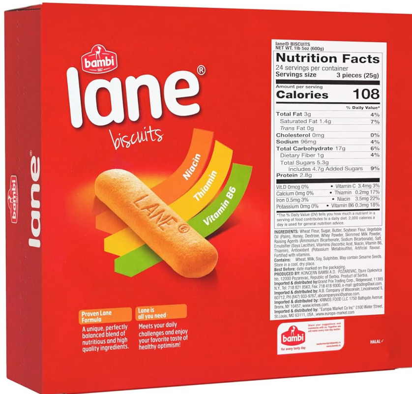
Image: Side view of the biscuit box.