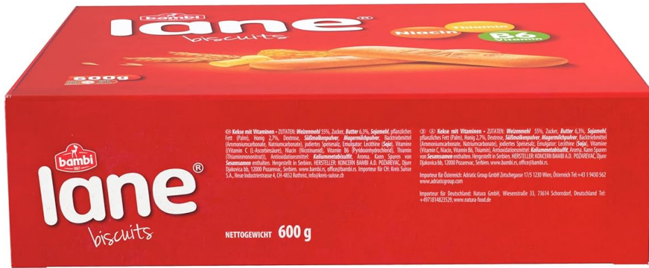
Image: Top view of the biscuit box.