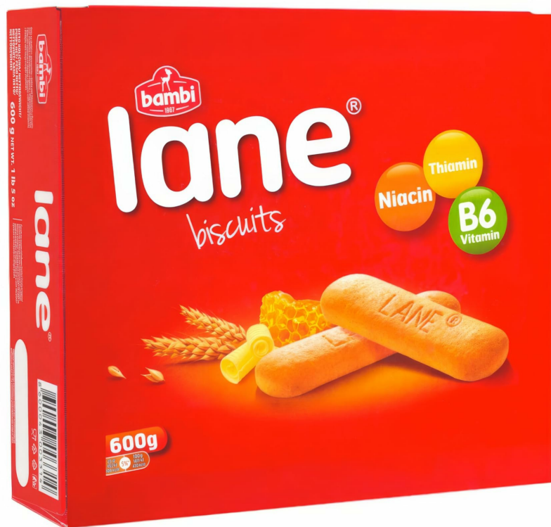
Image: Front view of Bambi Plazma Lane Biscuits 600g packaging, highlighting the product and key nutritional facts.