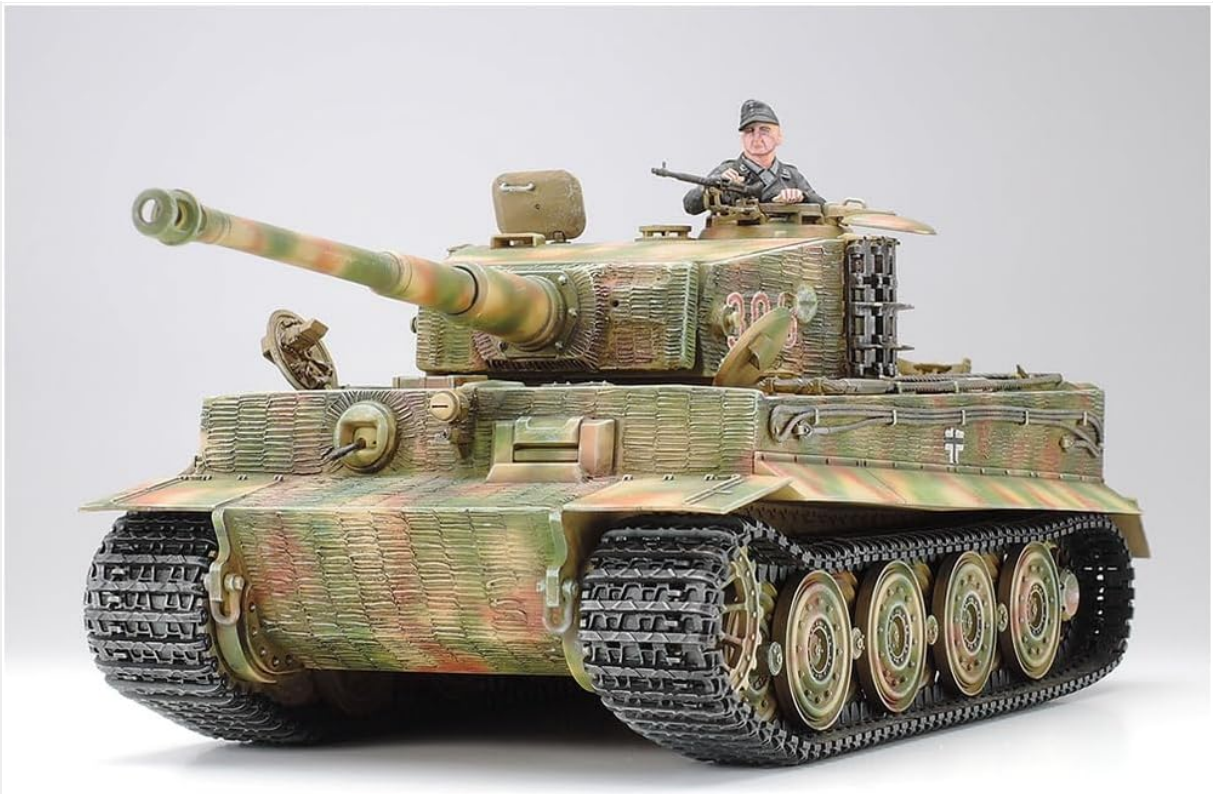
Figure 4.2: Completed TAMIYA Tiger I model, front-side view. This image showcases the assembled hull, turret, main gun, and a commander figure in the cupola.

Follow the diagrammatic instructions for assembling the main hull and turret components. Pay close attention to the orientation of parts and ensure all seams are clean and flush. The kit provides options for various details, so choose your preferred configuration before gluing.