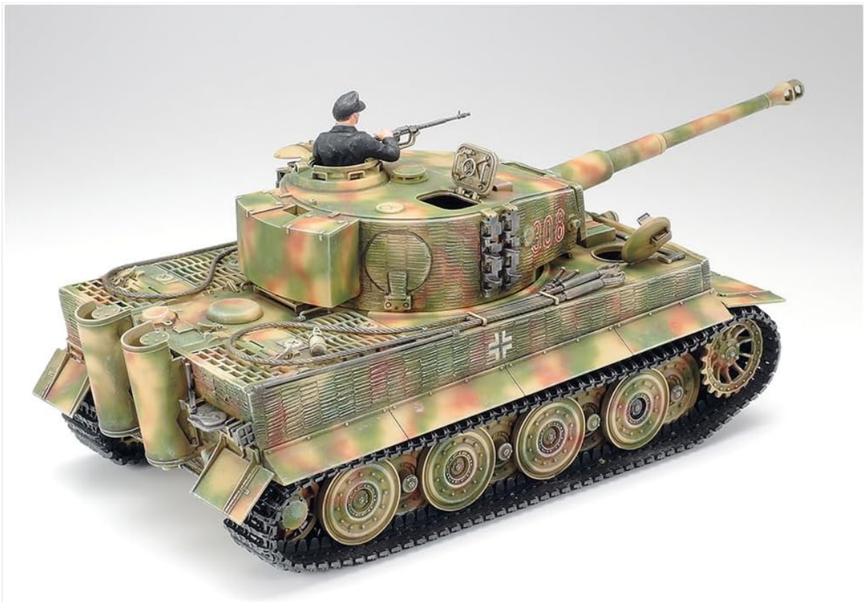
Figure 4.3: Completed TAMIYA Tiger I model, rear-side view. This image provides a view of the engine deck, exhaust systems, and rear hull details.