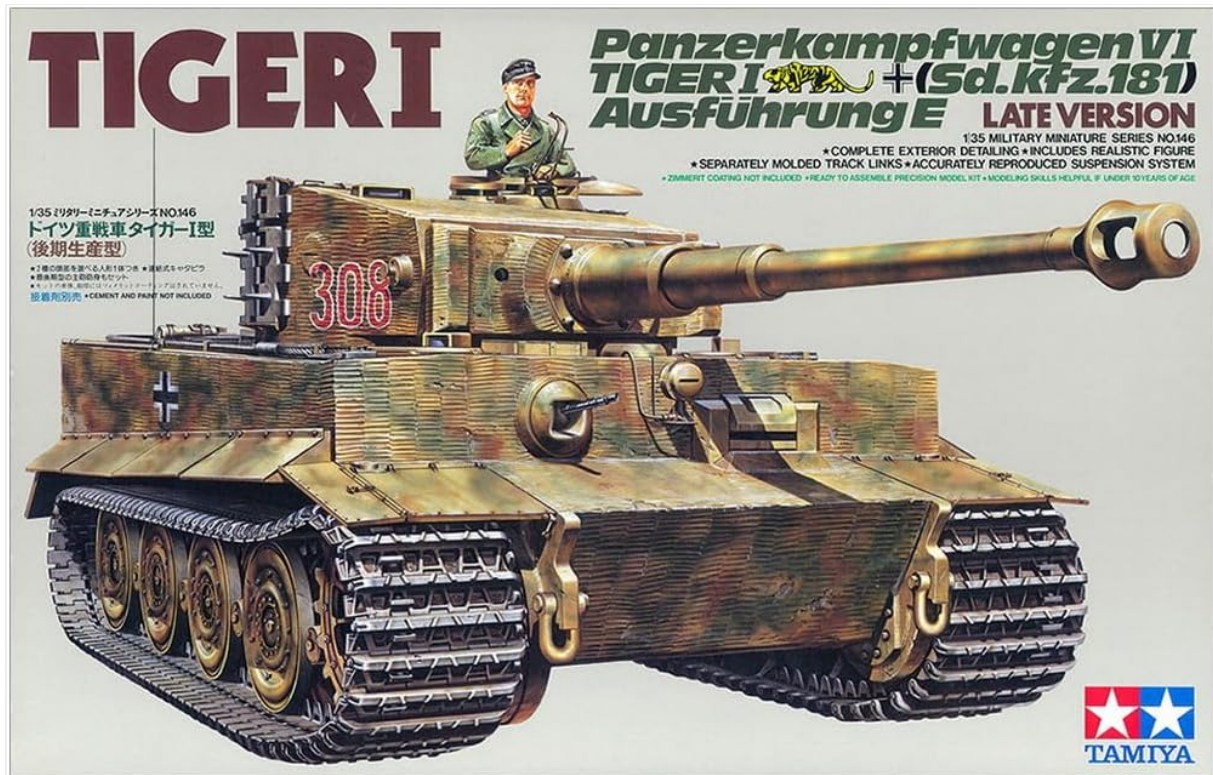
Figure 3.1: TAMIYA Tiger I (Sd.kfz.181) Model Kit Box Art. This image displays the packaging for the model kit, featuring a depiction of the completed tank and key product information.

Note: Adhesives, paints, and modeling tools are not included and must be purchased separately.