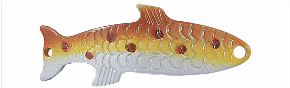
Image 1.1: The Acme Phoebe Spoon S300/BT, featuring its distinctive brown trout color pattern and curved body design.

This lure is effective when fished at various speeds and depths, making it suitable for different fishing conditions and target species.