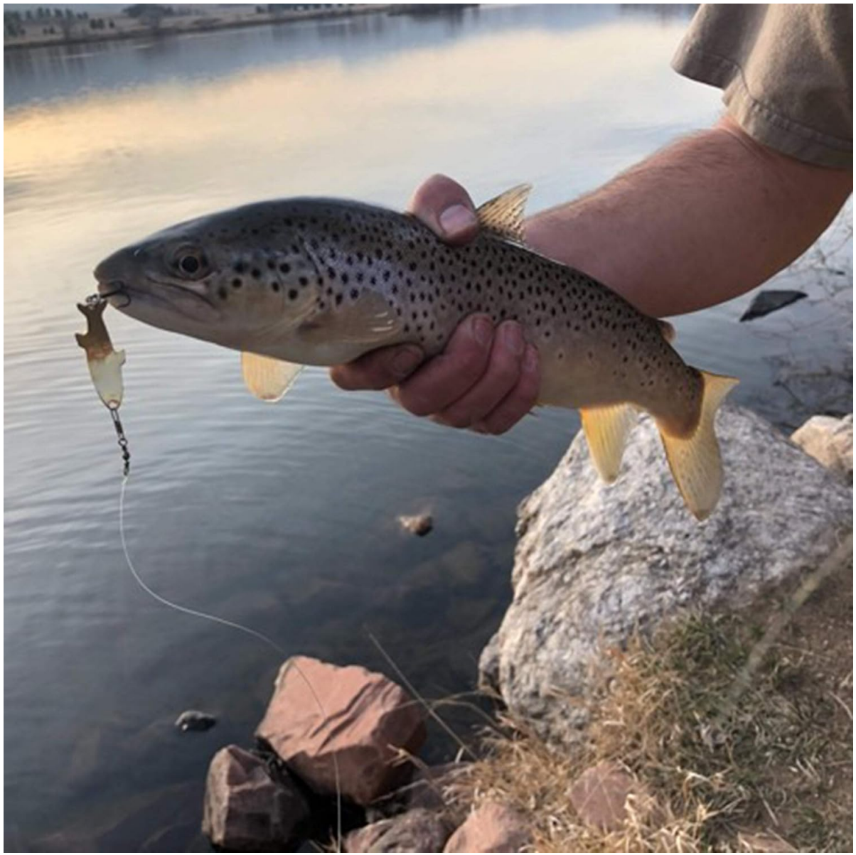
Image 3.1: A brown trout successfully caught using the Acme Phoebe Spoon, demonstrating its effectiveness.