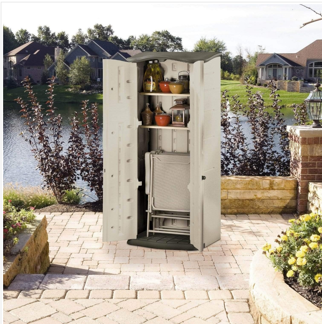
Figure 4: The shed's interior accommodating a folded chair and other garden essentials.