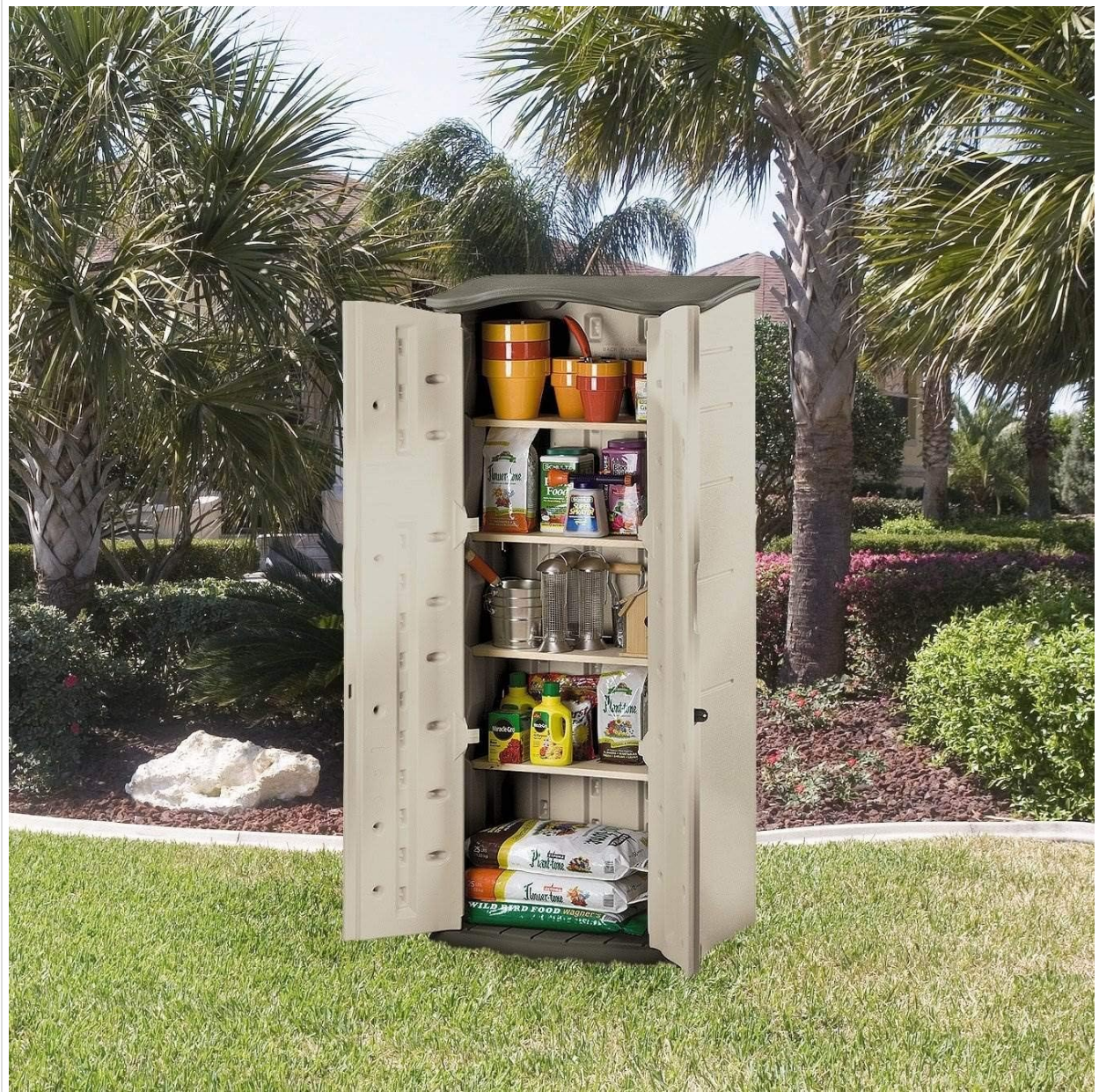
Figure 3: Interior view of the shed demonstrating storage with added shelves.