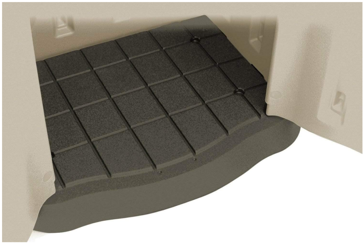
Figure 7: The durable, easy-to-clean floor of the shed.