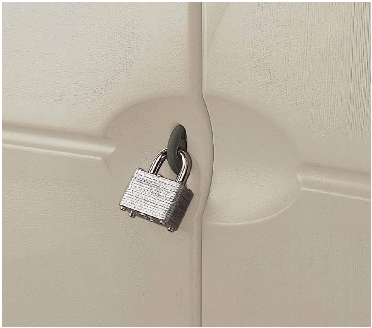
Figure 6: The integrated padlock hole for securing the shed.