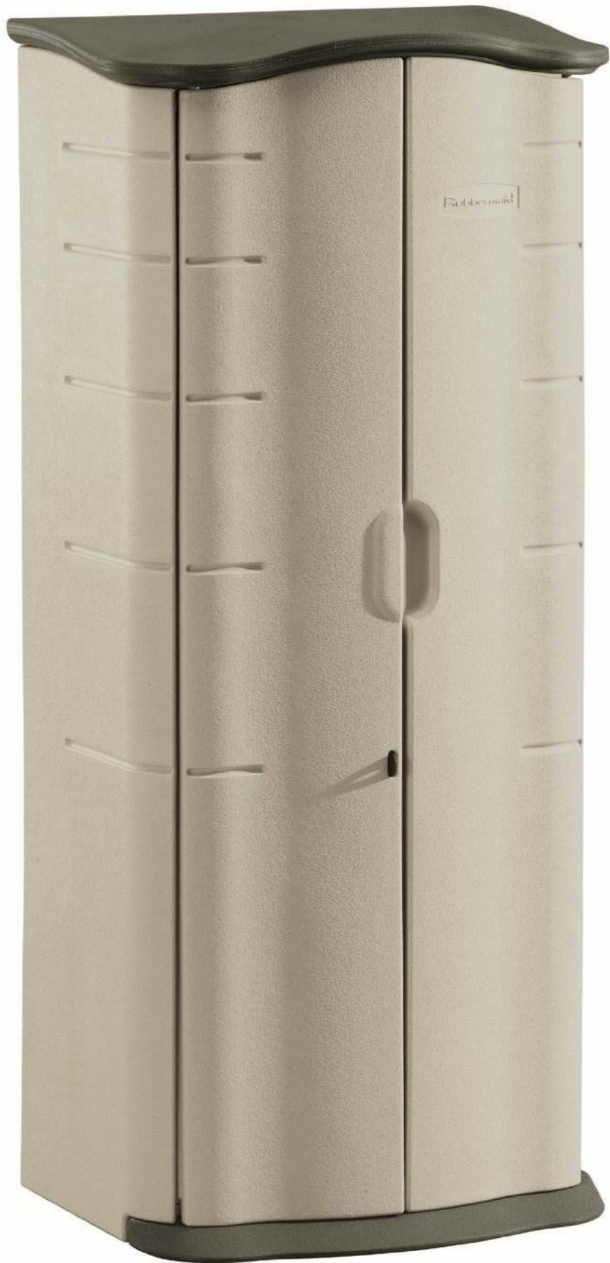
Figure 2: The fully assembled Rubbermaid Compact Vertical Resin Storage Shed.