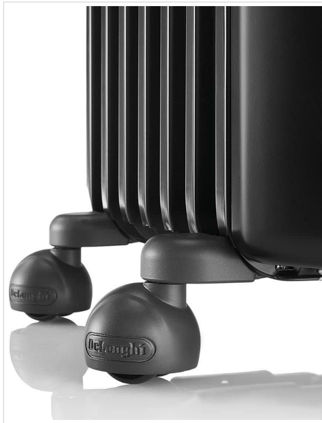
Close-up view of the pre-assembled casters at the base of the De'Longhi heater, designed for easy mobility.