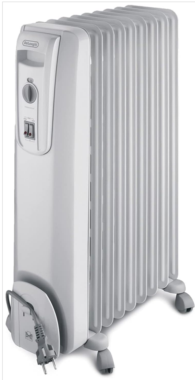
Front view of the De'Longhi KH770920 Oil Filled Heater, showing the control panel on the left and the heating fins on the right. The power cord is visible wrapped around the base.