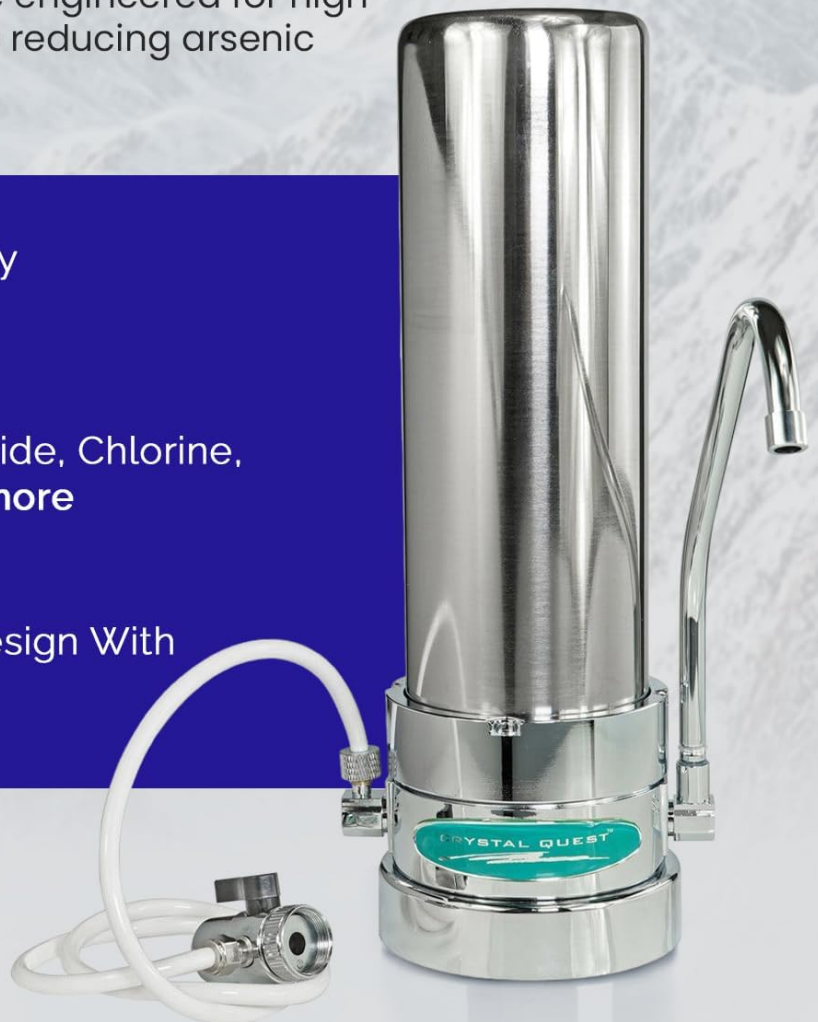
Image: The Crystal Quest Single Stainless Steel Countertop Water Filter System, showing the main unit, diverter valve, and connection hose.