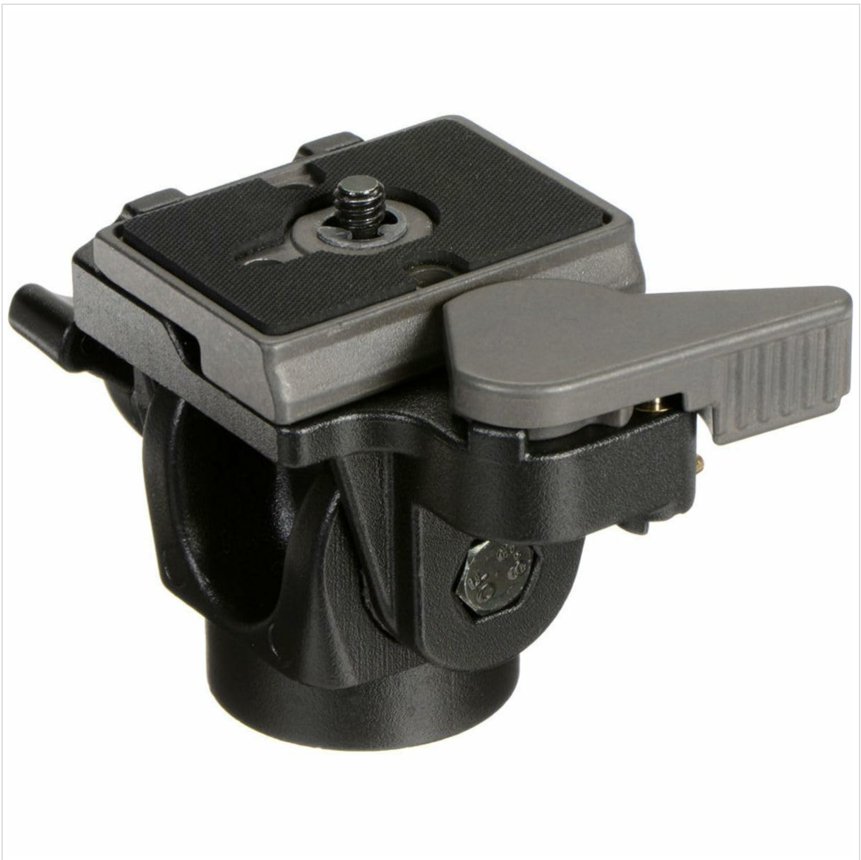
Front view of the Manfrotto 234RC Monopod Tilt Head, showing the quick release plate and locking knob.