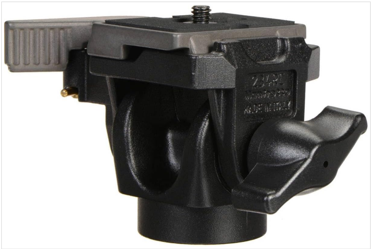
The Manfrotto 234RC Monopod Tilt Head showing the quick release plate mechanism.