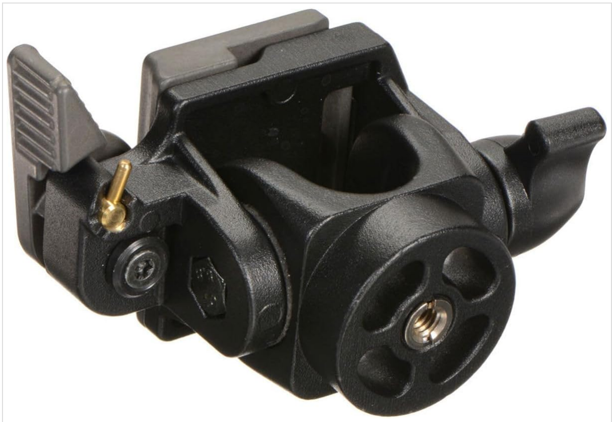
Side view of the Manfrotto 234RC Monopod Tilt Head, highlighting the locking knob for tilt adjustment.