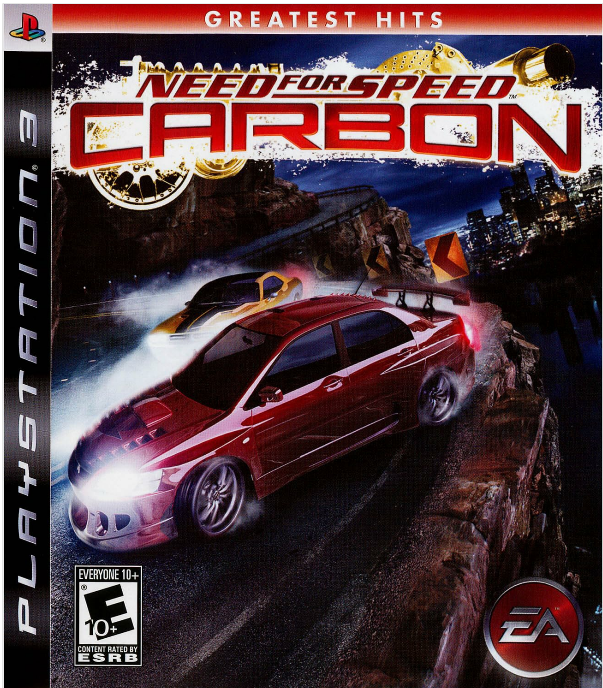
Figure 1.1: Need for Speed: Carbon Game Cover