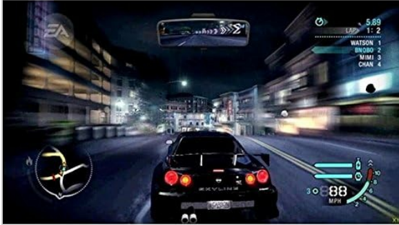
Figure 3.2: In-game racing scene with a Nissan Skyline