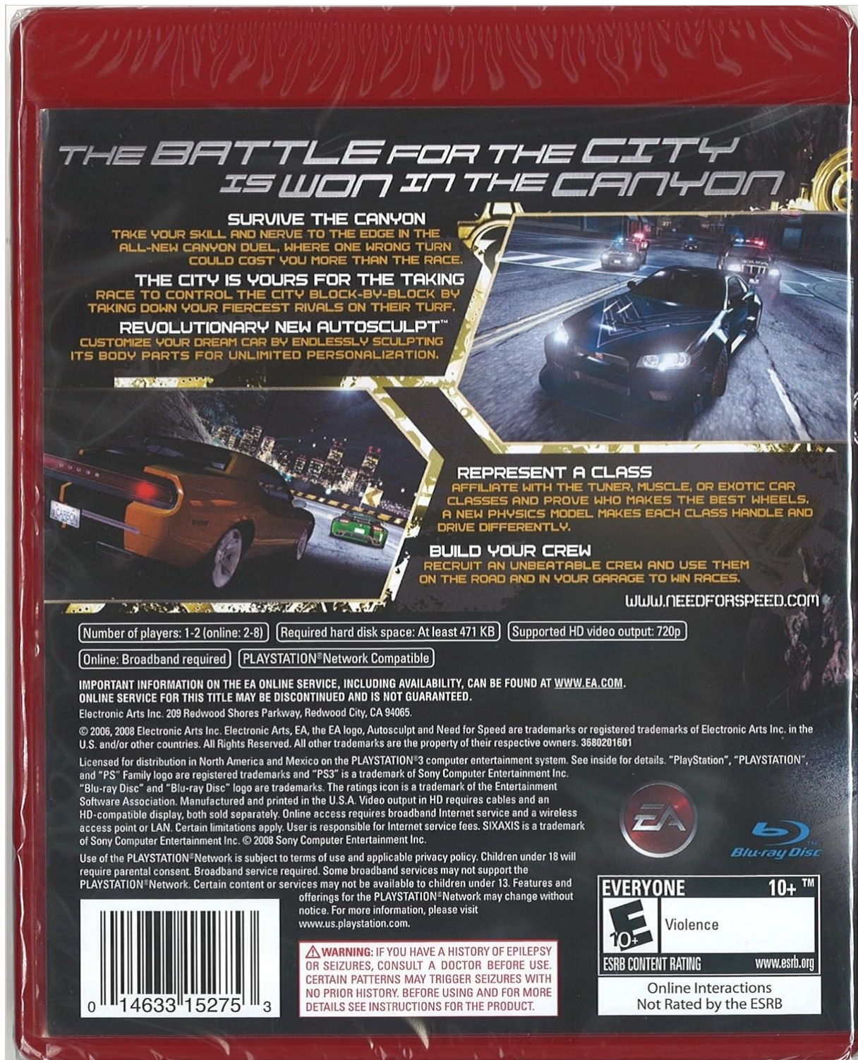
Figure 2.1: Game Case Back, detailing system and online requirements

Online multiplayer features require a broadband internet connection and a PlayStation Network account. Refer to the PlayStation Network terms of service and privacy policy for details.