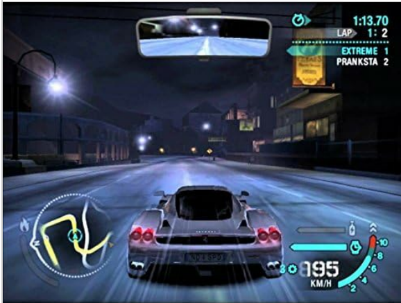
Figure 3.3: In-game racing scene with a Ferrari Enzo