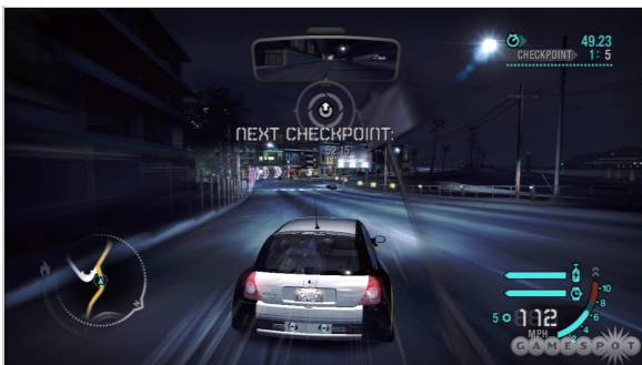
Figure 3.4: In-game racing scene with a Renault Clio V6