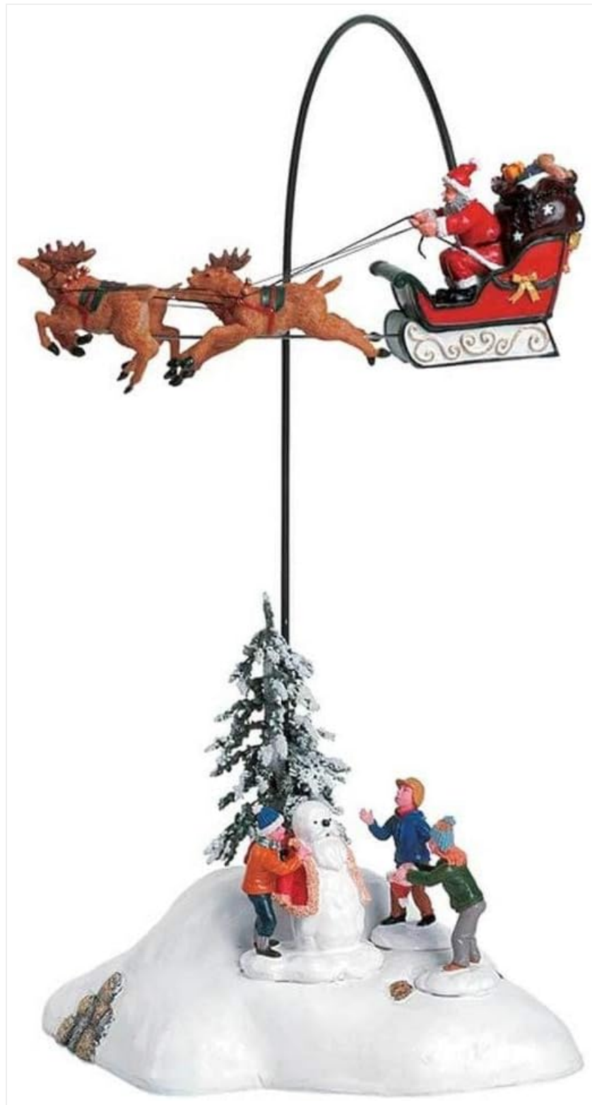
Figure 1: Lemax Santa Claus is Coming to Town Animated Display. This image shows the complete animated display, featuring a snowy base with three children building a snowman and a frosted Christmas tree. Above them, Santa Claus is depicted in his red sleigh, pulled by two reindeer, suspended by a black arched support structure, giving the illusion of flight.