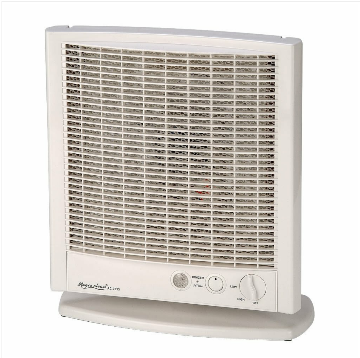
Image: Front view of the SPT Magic Clean AC-7013 Air Cleaner, showing its compact design and control panel. Dimensions are indicated as 13 inches in height, 13 inches in width, and 5.5 inches in depth. The control panel includes an ionizer/UV/TiO 2 button and a fan speed dial (OFF, LOW, HIGH).