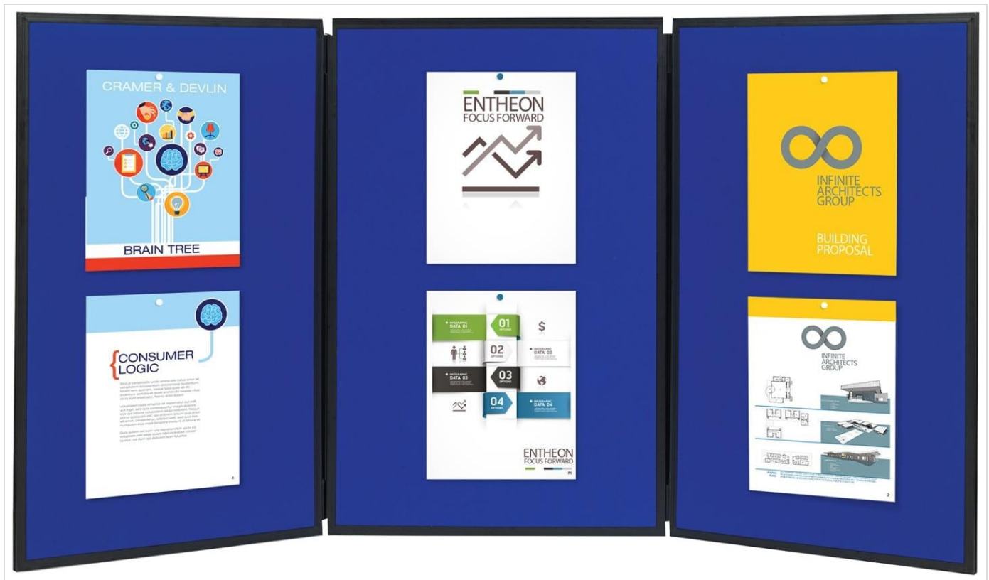
Figure 2: The display system in use, demonstrating how various documents can be attached to the blue fabric panels for a comprehensive presentation.