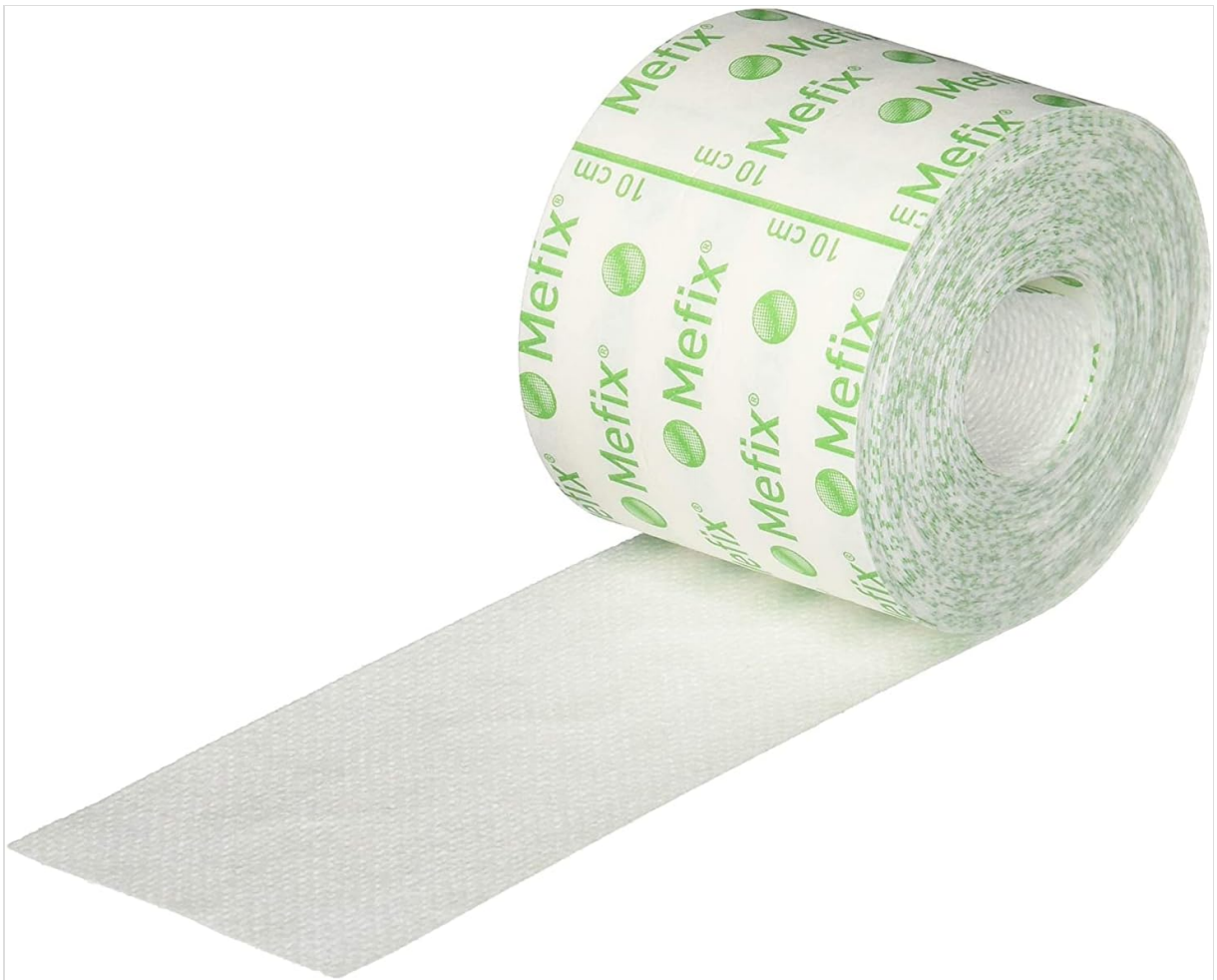
Image: Mefix Self-Adhesive Fabric Tape roll. This image displays the product as a roll of white fabric tape with a branded core, partially unrolled.