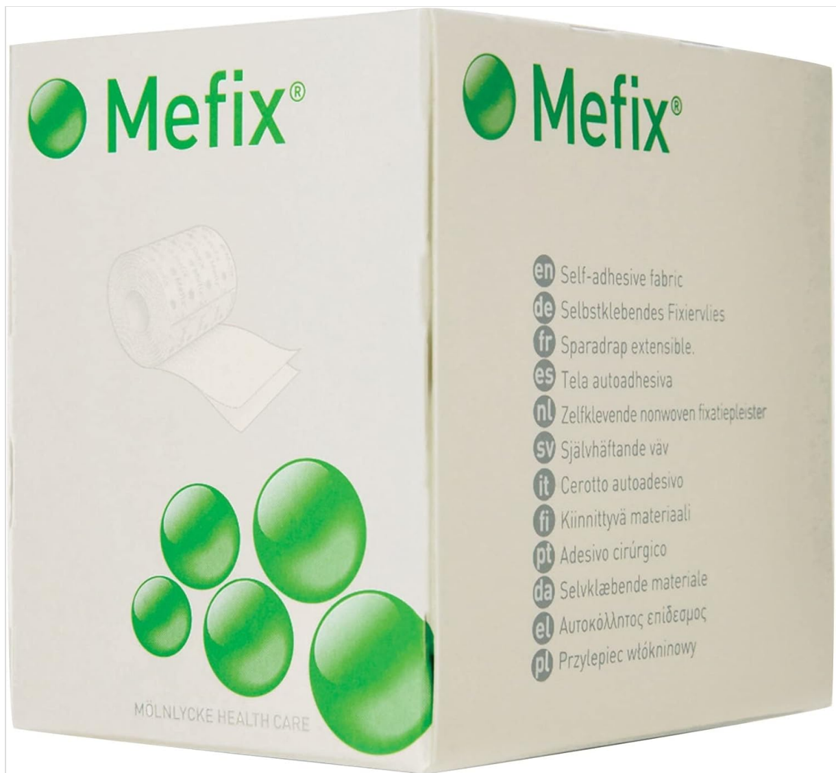
Image: Mefix Self-Adhesive Fabric Tape product box. The box features the Mefix logo and multilingual descriptions of the product.