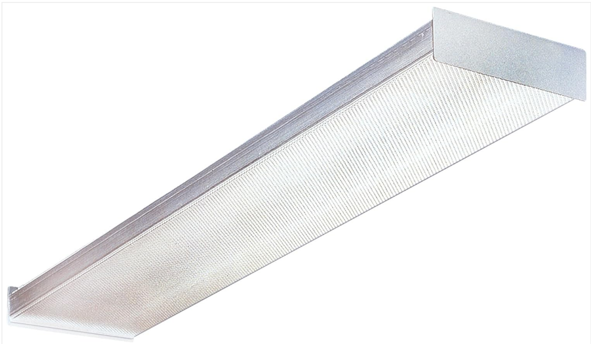
Image 1.1: Lithonia Lighting SB 232 120 GESB Wraparound Fluorescent Fixture.

This manual provides instructions for the safe installation, operation, and maintenance of the Lithonia Lighting SB 232 120 GESB Wraparound 2-head Narrow Body T8 Fluorescent Ceiling Fixture. This fixture is designed for general illumination in various indoor settings such as storage rooms, offices, or retail applications. Key features include a hinged design for easy cleaning, an instant-on electronic ballast to eliminate flickering and humming, and a prismatic diffuser for controlled light distribution.