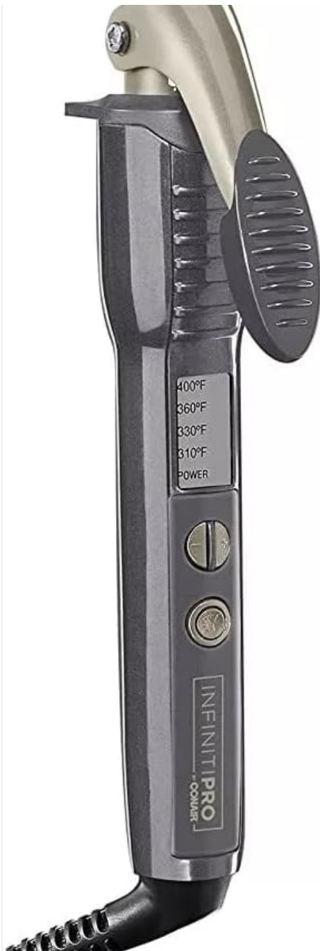
Image: The INFINITIPRO BY CONAIR Tourmaline 3/4-Inch Ceramic Curling Iron, featuring a gold-colored barrel and a dark gray handle with control buttons.