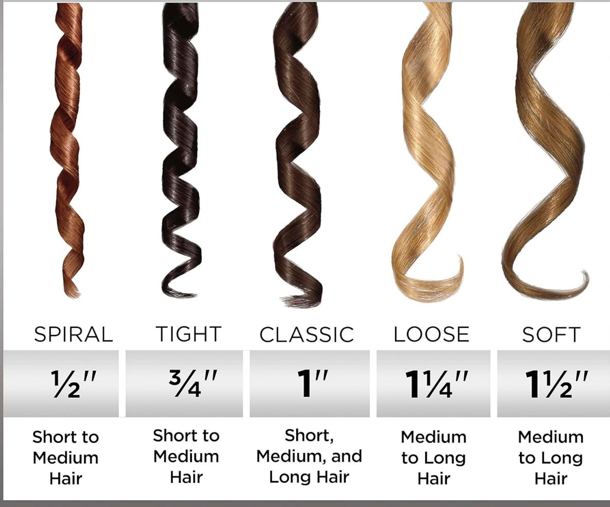
Image: A visual guide demonstrating various curl styles (spiral, tight, classic, loose, soft) and the corresponding barrel sizes (1/2", 3/4", 1", 1 1/4", 1 1/2") and recommended hair lengths. This 3/4" iron is ideal for tight curls on short to medium hair.