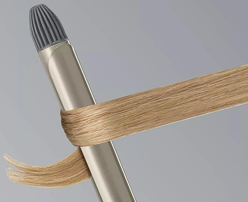
Image: A close-up of the curling iron barrel with a section of hair being curled, illustrating the tip to leave the last inch of hair out for a natural, beachy look.

Leave the last inch of hair out when curling for a more natural, beachy look.